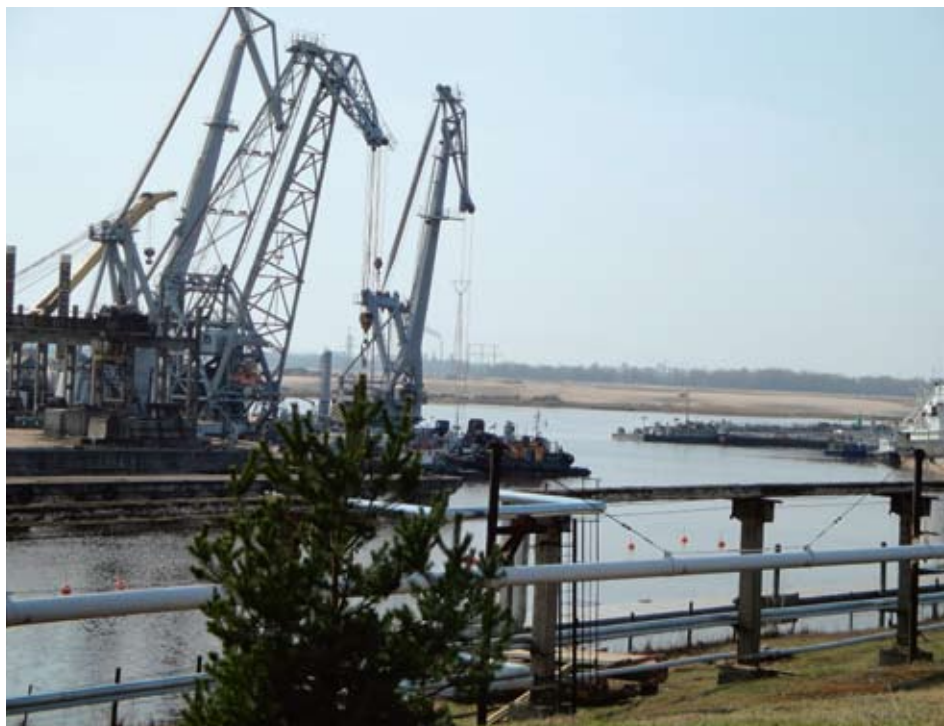
In Latvia Switzerland plans to support the remediation of the oil-polluted Sarkandaugava area in the industrial port of Riga with CHF 13 million (see photo). This should also halt the pollution of the River Daugava which flows into the Baltic Sea.