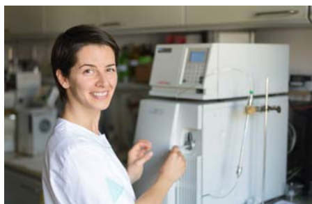
Research fellowships have promoted the scientific careers of numerous promising young scientists.

Based on Switzerland's dual education system, 32 vocational schools in 19 cities are currently training 1,134 apprentices. With the support of 170 partner companies, these are being trained in 12 professions with updated curricula. At the same time, much progress has been made in VET reform with the participation of all stakeholders. A milestone was reached with the enactment of the ordinance on dual vocational education and training, which was amended on the basis of the project's recommendations.