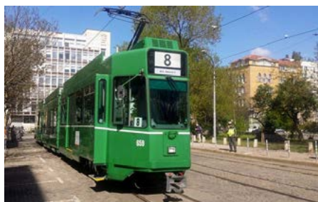
The trams from Basel now operating in Sofia offer passengers increased comfort and a low-floor entrance, making it easier for people with disabilities to board.

A Swiss firm has delivered 28 decommissioned trams from Basel's transport system to Sofia. In this way, Switzerland is helping to improve the public transport system in Sofia and at the same time reduce traffic congestion and air pollution. In addition, the city planners have worked together with a specialist firm to develop a concept for sustainable mobility in Sofia.