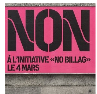
The No campaign for the vote on the 'No Billag initiative'