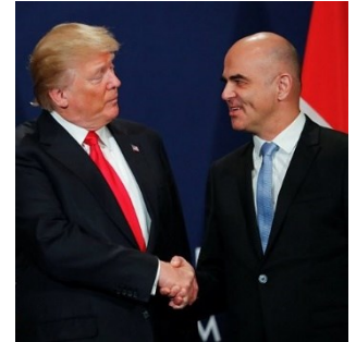
President of the Swiss Confederation Alain Berset and US President Donald Trump at the WEF in Davos

Office of Justice also received mention: as a rule, Switzerland does not grant extradition requests for political offences. The media were less critical about the report of the visit of the former Catalan leader Carles Puigdemont to Geneva and the stay of another Catalan separatist, Marta Rovira, in Switzerland. The debate about a possible extradition procedure was treated by the media as an opportunity to analyse Swiss penal law. Outside Spain, some media outlets also described the way Switzerland and other European countries deal with potential extradition and legal assistance requests.