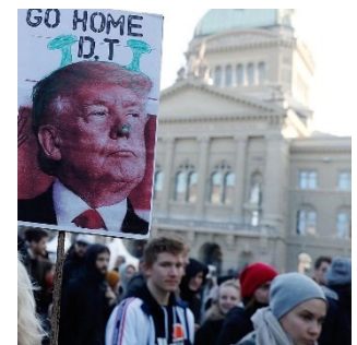
Demonstration in Bern against Donald Trump's visit to the WEF