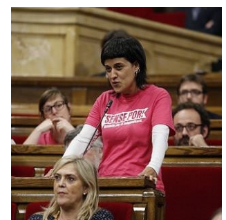
Catalan separatist Anna Gabriel in Switzerland