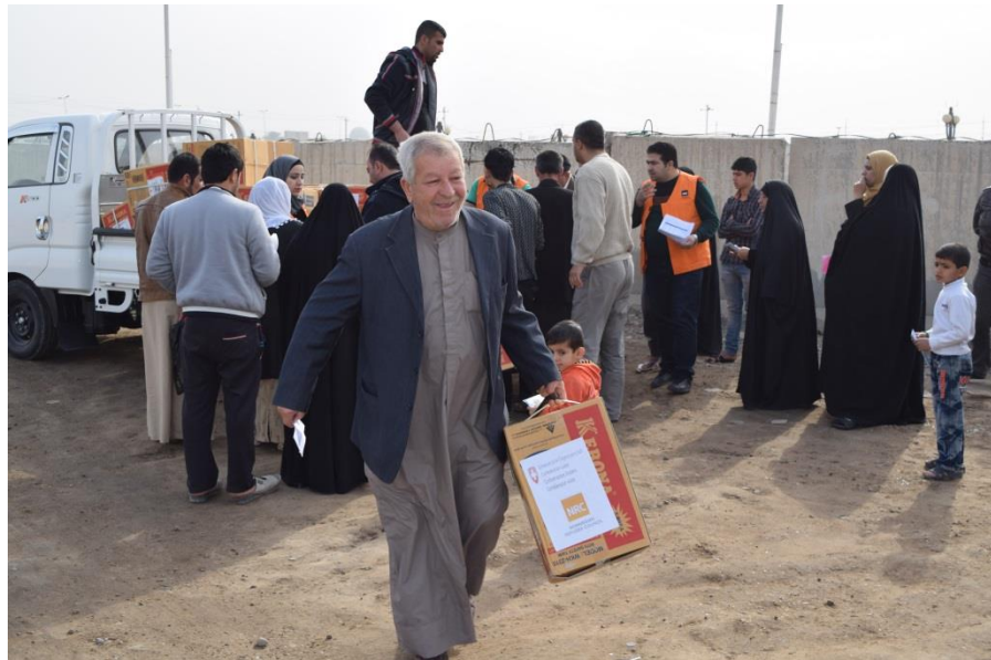
An internally displaced person receiving a space heater from NRC in Baghdad