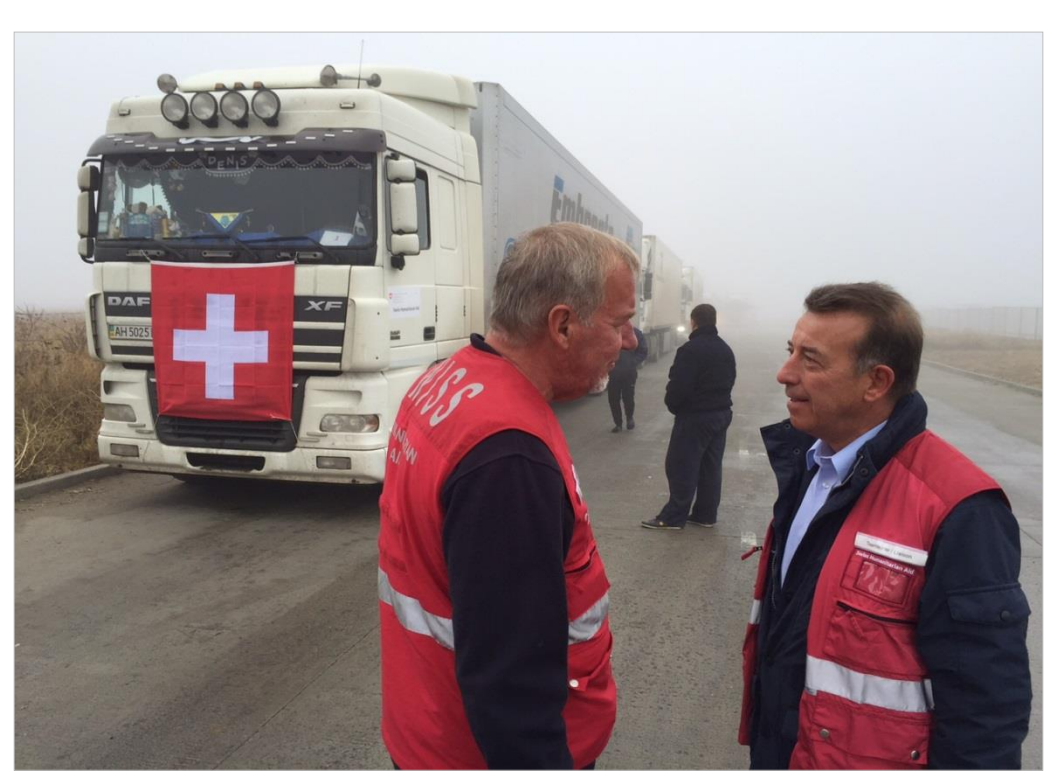
Since April 2015, SDC Humanitarian Aid has organised six humanitarian road convoys of water treatment materials and medical supplies to the Donetsk region.

Swiss Cooperation Office in Ukraine since 1999