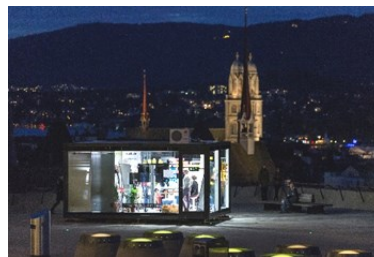
ETH Entrepreneur Club in Cube 2017.