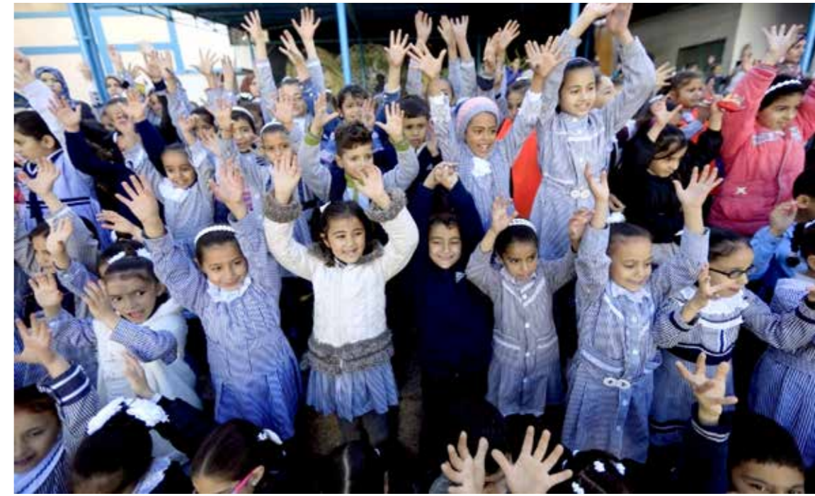
330'000 children in the oPt have access to quality education in UNRWA schools.