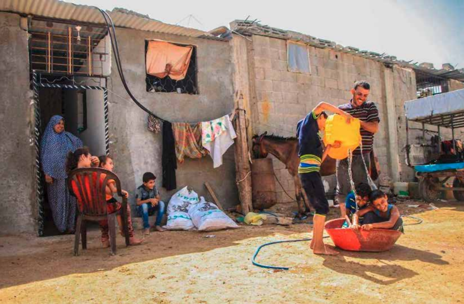
Family life in the Gaza strip. Only one in 10 people has direct access to clean and safe water while 97% of freshwater from Gaza's aquifer is unfit for human consumption.