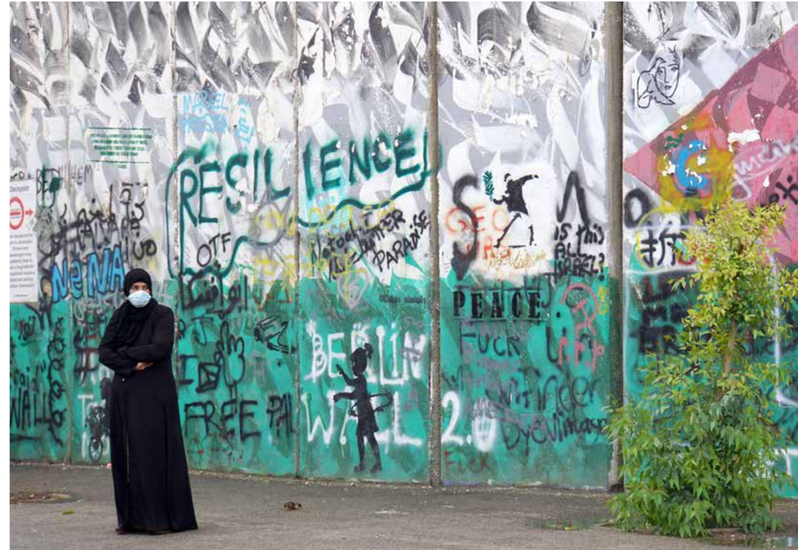
Resilience and longing for peace – scene at a bus stop in Bethlehem.