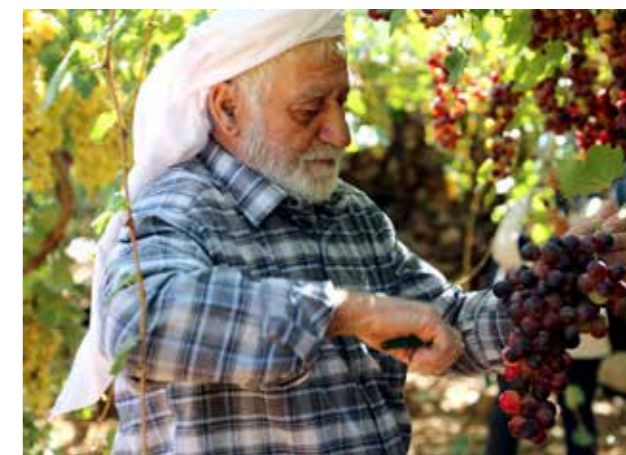
Switzerland promotes support and technical innovation for smallholders – a contribution to foster food security and access to land in the oPt.

In line with the peace promotion strategy of the Human Security Division (HSD) for Israel and the oPt, Switzerland has contributed to inclusive dialogue, both within the Israeli and Palestinian societies, as well as between them. Through diplomatic and programmatic engagement, it has encouraged innovative approaches to addressing the conflict and contributed to de-escalating tensions. For example, Switzerland co-mediated a ceasefire agreement between Israel and Hamas in November 2018. In 2017, Switzerland negotiated the elaboration of a document (the Swiss roadmap) between Palestinian factions that laid the ground for a consolidation of the civil service in the Gaza Strip.