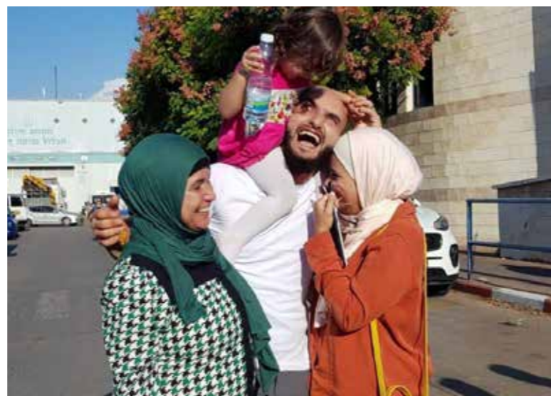
The promotion of Peace, Human Rights and International Humanitarian Law is a central pillar of Swiss engagement in the oPt and Israel. A Palestinian released from administrative detention in Israel is greeted by his family.

Gender inequality is widespread. Despite higher levels of education, women in the oPt participate far less in the political arena 7 or formal labour market than men (19% vs 81%) and suffer from multiple forms of discrimination and violence. Gender-based violence and domestic violence are on the rise 8 , for reasons attributed to the occupation and patriarchal traditions as well as lockdown measures introduced in the wake of the COVID-19 pandemic. In Israel, despite progressive laws against gender segregation, respect for the rights of women and girls and their representation in the public sphere is a growing concern. Young girls and boys are being impacted by increasing domestic violence and the closure of classrooms. These trends tend to reinforce traditional gender roles.