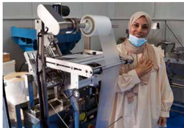
This Palestinian businesswoman expanded her family enterprise thanks to a new packing system for dates, purchased with Swiss support.

In order to achieve its objectives, Switzerland will explore new fields of cooperation by venturing into new themes (innovation, job opportunities), establishing new partnerships (research, private sector where possible) and by bringing in Swiss expertise, while continuing its engagement for a just and sustainable solution to the conflict.