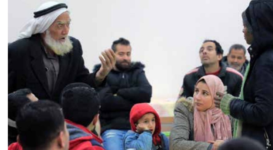
Debate between members of a community on future projects for their village.