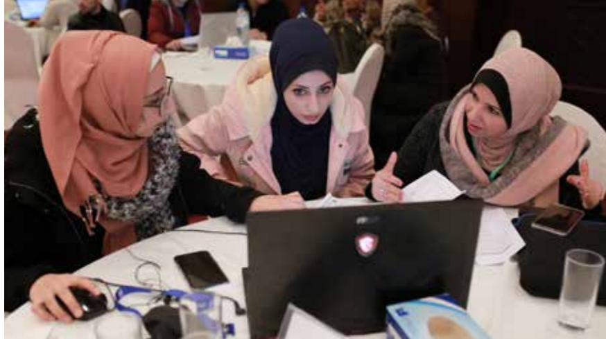
Youth brainstorming at a “hackathon” (software development event) in Gaza sponsored by the SDC and UNDP job creation program.