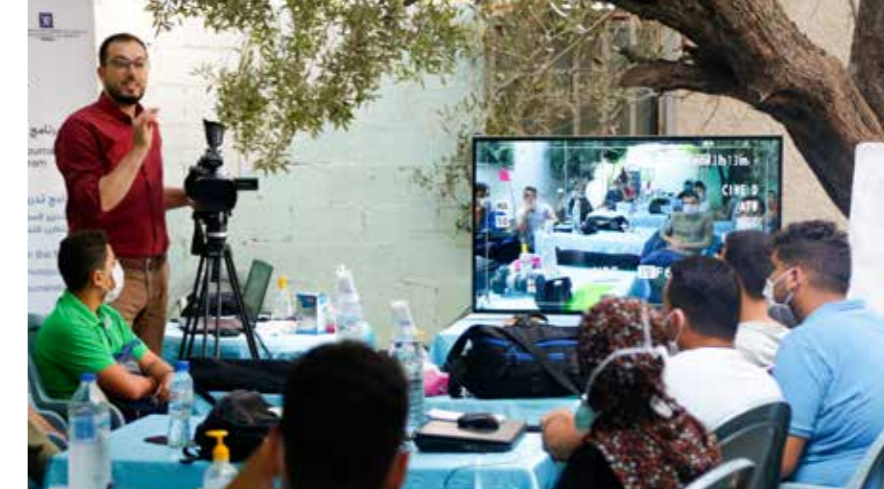
Training course for young journalists in the frame of the project "Strengthening Free & Independent Media in Palestine" co-funded by the Swiss Government.