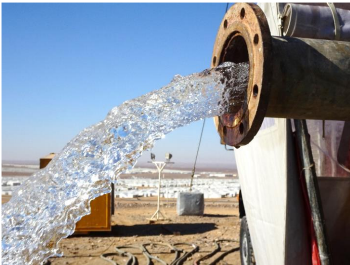
Pumping test