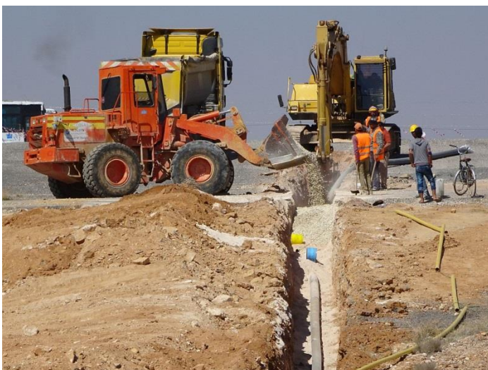
Installation of 180 mm main water pipeline, @SDC