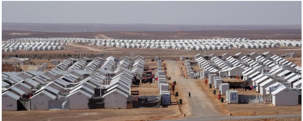
Part of Azraq Refugee Camp

Switzerland's engagements in Jordan, Syria, Lebanon, Iraq and Turkey are coordinated by the Swiss Cooperation Office in Amman.