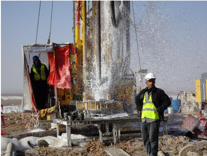
Drilling borehole