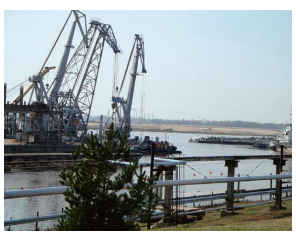
In Latvia Switzerland plans to support the remediation of the oil-polluted Sarkandaugava area in the industrial port of Riga with CHF 13 million (see photo). This should also halt the pollution of the River Daugava which flows into the Baltic Sea.

The enlargement contribution is an instrument of Switzerland's policy towards Europe. With its enlargement, the EU contributes to stability, peace and prosperity in Europe, which is also in Switzerland's interests. Switzerland's enlargement contribution shows solidarity in supporting EU efforts to reduce economic and social disparities between the new and old EU member states, thus promoting cohesion within the Community. Thus, the enlargement contribution