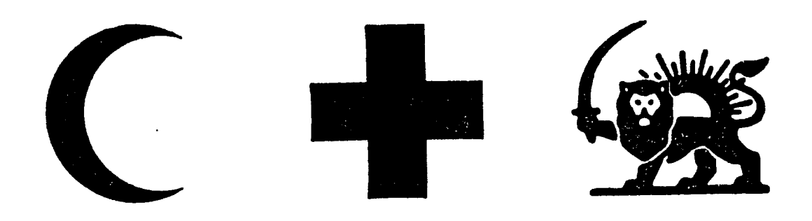
Figure 2: Distinctive emblems in red on a white ground

The distinctive emblem (red on a white ground) shall be as large as appropriate under the circumstances. For the shapes of the cross, the crescent or the lion and sun, the High Contracting Parties may be guided by the models shown in Figure 2.