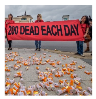
General criticism of US pharmaceutical company Purdue accompanies reports on Swiss accounts from its owner family