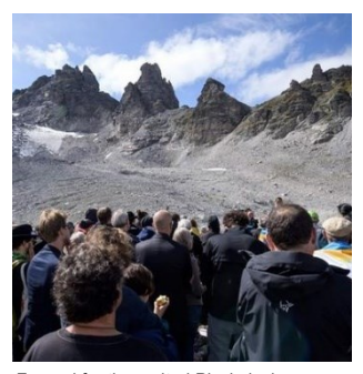
Funeral for the melted Pizol glacier