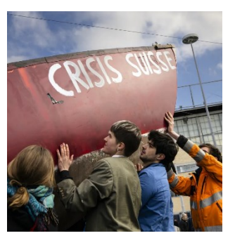
Demonstrators shortly before the general meeting of Credit Suisse in front of its headquarters in Zurich.

coverage. While the Federal Council's decision came in for some qualified criticism in the leading Western media, it led to some very heated exchanges on social media internationally. Swiss neutrality in general also continued to attract media attention. German media in particular highlighted the growing lack of understanding of Switzerland's position abroad and the possible negative consequences for its reputation. The video address of Ukrainian President Zelenskyy to the Swiss parliament was generally reported abroad in a concise and objective manner.