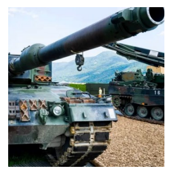
RUAG had acquired the Leopard 1 tanks from the Italian military.