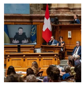
Address by President Volodymyr Zelenskyy via video conference before the Swiss parliament on 15 June.