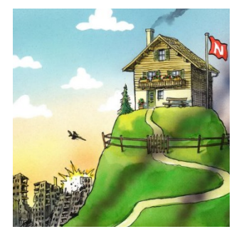
Cartoon depicting the attitude of neutral states, with a clear allusion to Switzerland. (© Economist )

employees of Gazprombank Switzerland on charges of money laundering related to funds deposited in Switzerland by members of the Russian president's entourage was also in the spotlight. The media interpreted the trial as a test of the Swiss financial centre's handling of Russian assets. Switzerland's neutrality also attracted considerable general commentary from the media – mostly critical. Across all those topics, various narratives critical of Switzerland can be observed in the foreign media, often particularly contentious on social media: Switzerland refuses to support Ukraine despite the clarity of the situation, its behaviour is unethical, and it is consequently an accomplice of the aggressor. Because it is preventing other Western countries from providing support to Ukraine, it is questionable to what extent it remains a reliable partner of the West. Under the guise of neutrality, Switzerland is primarily pursuing its own economic interests. For this reason it is only taking halting action with regard to the Russian oligarchs' assets. The Russian media, on the other hand, continues to propagate the narrative that by joining the EU sanctions, Switzerland has abandoned its neutrality.