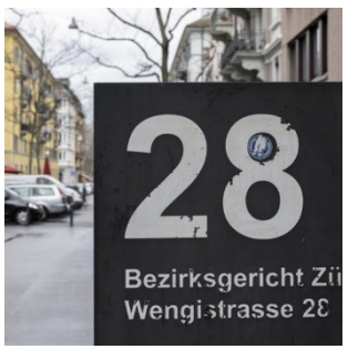
In their coverage of a money-laundering trial, some media outlets also drew parallels with Switzerland's attitude to Russia.