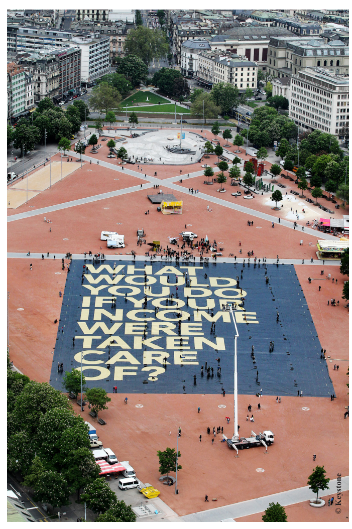
All eyes on Switzerland: "unconditional basic income for all" referendum campaign in Geneva.

The foreign media coverage of Swiss referendums tends to follow a similar pattern. Isolated reports appear as the last day of voting draws near. The volume of subsequent media reporting varies considerably across countries depending on the level of domestic interest and debate on the given issue, and on how fiercely the referendum campaign was fought in Switzerland. Foreign media interest peaks immediately before and directly after the vote. However, only referendums which are of considerable international relevance like the "Stop Mass Immigration" initiative continue to receive foreign media attention.