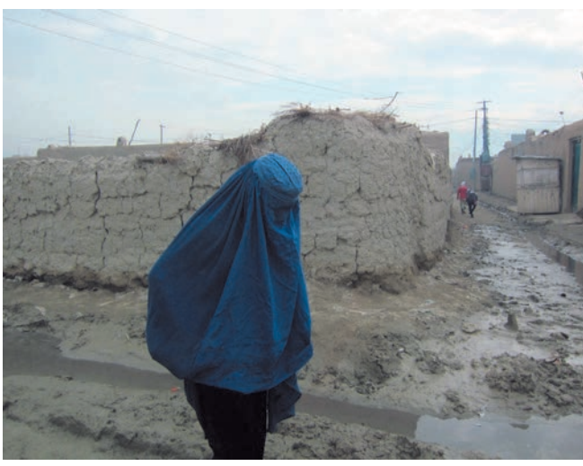
Woman walking in the streets of Kabul, Afghanistan

Results-based frameworks in cooperation strategies help to achieve results in fragile contexts and define the implementation modalities. The programs are systematically adapted to the actual scenario. The result frameworks are key in order to comply with the principles of downward- and upward-accountability. Specific management and performance results have to be defined in the Result Framework 1) one on CSPM Implementation (e.g. work force diversity or specific contribution to donor coordination), and 2) one on the policy contribution aid for peace.