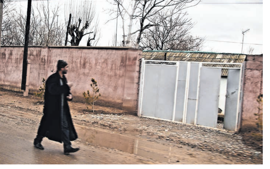
Open gate. Dushanbe, Tajikistan