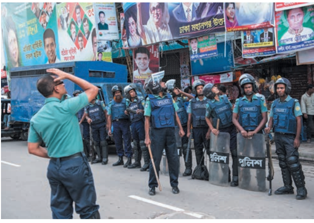
Bangladeshi police men preparing for their mission during political strikes, Dhaka

Sound conflict analysis guides SDC's contribution to the reduction of conflicts around natural resources. In Honduras, SDC supports a watershed program that serves as a vehicle to address underlying causes of violence such as social exclusion, lack of state legitimacy and local economic development. The program contributes to local ownership and the strengthening of the legitimacy of state entities and additionally to disaster risk reduction. With the Blue Peace project, SDC contributes to building the foundations for the future cooperative management of the Orontes basin's water resources at local, national and transboundary level. The project is based on the assumption that if water can contribute to conflict, for instance in Syria, in can also be a source of reconciliation and that concerted water management can contribute to peacebuilding. In Colombia, through the IAPRE project (do no harm in land restitution), SDC contributes to the mitigation of conflicts that are generated by the transitional justice policy that seeks to return the land to the people who have been dispossessed by armed conflict. Through the institutionalization of instruments that enhances the context analysis, the awareness of public officials and judges, the project aims to reduce the negative effects of land restitution during the armed conflict.