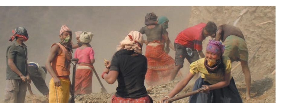
Labour-based road construction programme (DRSP) of SDC in Nepal. As a result of a conflict sensitive programme management, the work could be continued also during the armed conflict.

Building peace and increasing state responsiveness requires a political process for transforming power dynamics and economic relationships. Resistance and setbacks are to be expected. Supporting champions of reform is crucial and requires adept political dialogue to build trust and manage risks. SDC actively participates in donor coordination (in FCS a bottom up-approach in donor coordination is often more suitable for SDC, given the highly politicized context on national level), established international processes, as well as international organizations. On the global level, SDC has a number of priority multilateral organizations, of which it is among the top ten donors. It takes an active and recognized part in their steering, as shareholder, and brings its field perspective into global discussions. For a country specific example of an aid-for-peace-guided program, SDC is part of the Nepal Peace Trust Fund (NPTF), a joint funding mechanism to support constructive collaboration between the parties of the armed conflict and the implementation of the 2006 Comprehensive Peace Agreement . A specific contribution in FCS can be for SDC to insist that, the Office of the High Commissioner for Human rights is represented in Development Fora.