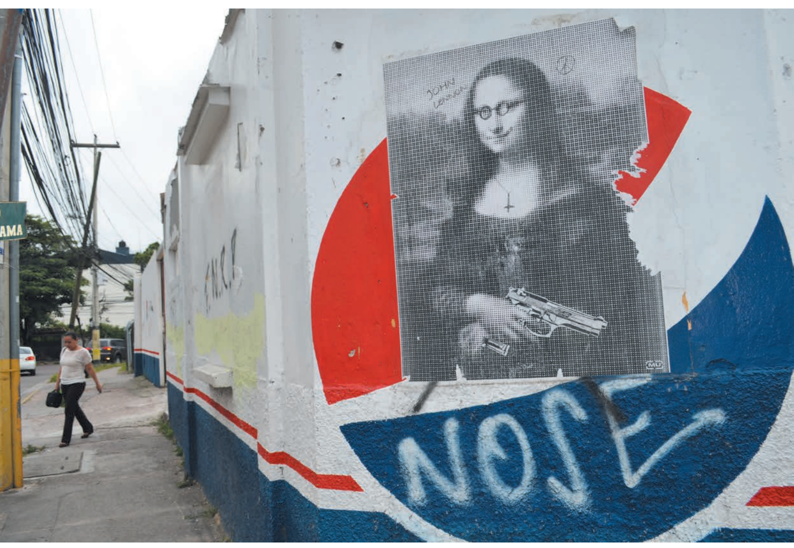
Graffiti art in the streets of Tegucigalpa, Honduras