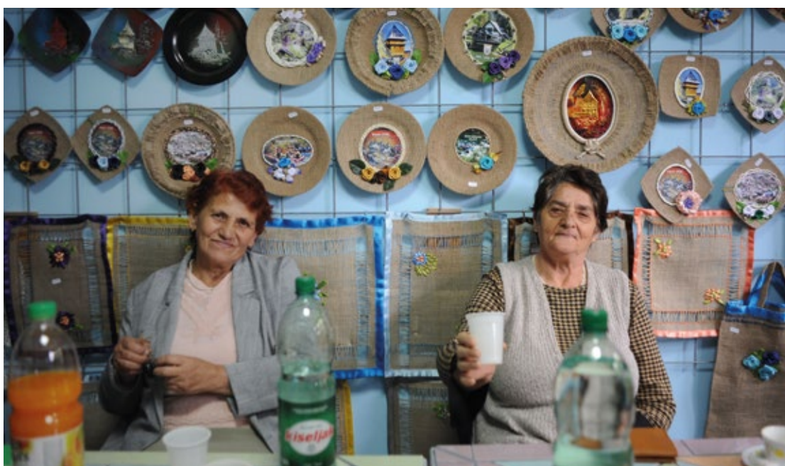
Occupational therapy helps persons with mental disorders doing their day-to-day tasks and enables them to integrate in their community.

local development planning are open for inter-municipal and inter-entity cooperation; their projects are likely to succeed and become sustainable, without need for further donor support. A legal framework defining the overall development management system has been adopted by the Parliament of the Federation of Bosnia and Herzegovina. Improved municipal governance and utility management, combined with some infrastructure investments, have triggered a multiple of additional investments within the same sectors. 23 municipalities are far advanced in developing the Business Friendly Certification process which will attract urgently needed investments from the private sector to create jobs and to generate public revenues. Over 200,000 citizens have benefited from revitalised public service delivery disrupted by the 2014 floods. New interventions including Disaster Risk Reduction measures have been prepared for the improvement of water supply and sanitation systems in two cities with a population of over 200,000 people. Gender Equality Mainstreaming has become an underlying principle in the new Law on Strategic Planning of the Federation of Bosnia and Herzegovina: in certain fields, over 60% of direct beneficiaries are now women.