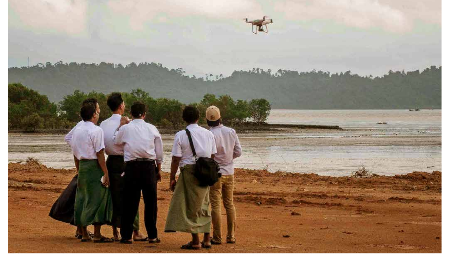
Drone flying training for land use mapping