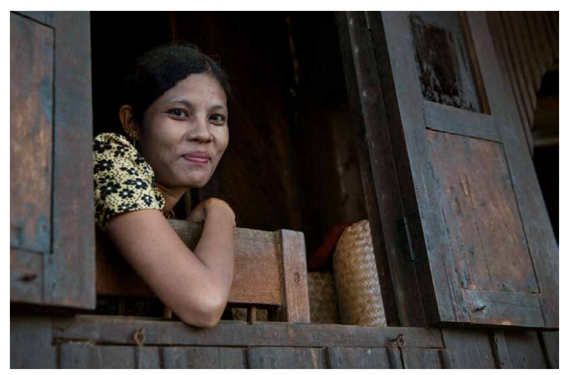
Young woman looking from a traditional house's window, © John Rae / LIFT-UNOPS

Under the integrated Swiss Cooperation Strategy Myanmar 2013-2017, extended through 2018, Switzerland supported initiatives in vocational skills development, agriculture and food security, health, social services and local governance as well as peace promotion, democratisation and protection, with a total expenditure of CHF 179m over 6 years. Achievements included 16.6m disadvantaged people reached through multi-donor funds for better health and livelihoods, and systems strengthening in vocational skills training, health and land governance. Working at national level and on the ground in the southeast of the country (conflict-affected Kayin and Mon States) as well as in support of the peace process, Switzerland has earned a reputation as reliable partner.