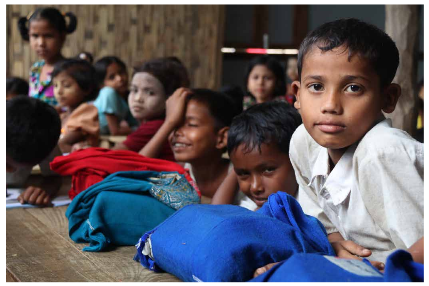
Children learning in a Temporary Learning Space in Maw Thi Nyar IDP Camp, Sittwe Rakhine State