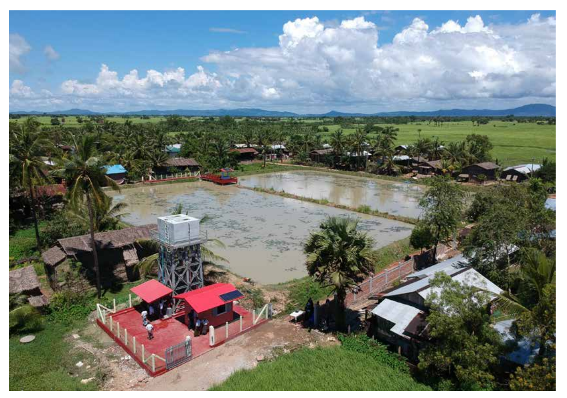
Pond rainwater harvesting in Mon State