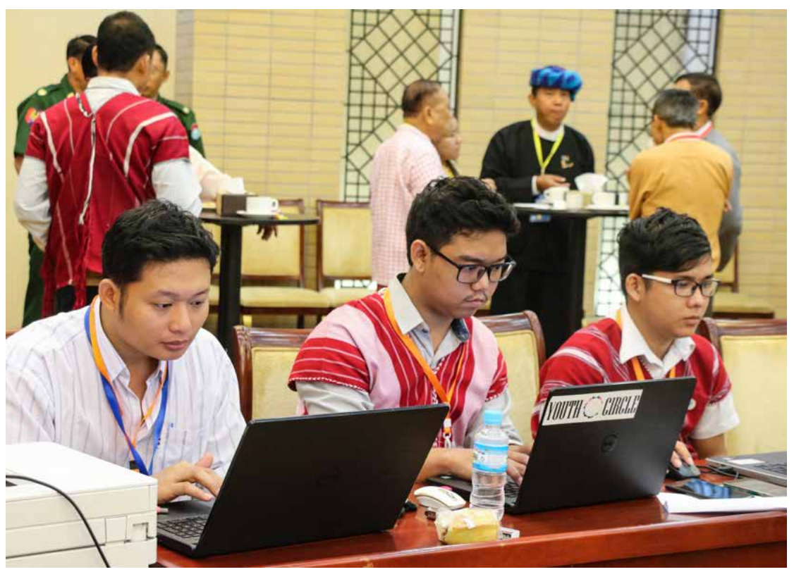
Youth Circle members documenting the 3rd Union Peace Conference, © Youth Circle Myanmar

Under the Swiss Cooperation Programme in Myanmar 2019-2023, Switzerland contributes to a peace ful, inclusive, democratic and prosperous society by promoting sustainable development, conflict trans formation, reconciliation and the participation of all people in statebuilding. The programme prioritises three domains of intervention: 1. Peace, Statebuilding and Protection; 2. Skills and Market Development; and 3. Health. Governance, gender as well as disaster risk reduction/climate change adaptation are crosscutting themes. The overall budget is CHF180m, distributed roughly as follows: Peace, Statebuilding and Protection 53%; Skills and Market Development 30%; Health 15%; and 2% for other interventions.