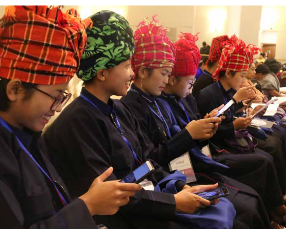
Attendees at the Womens League conference, © Ei Ei Han / JPF