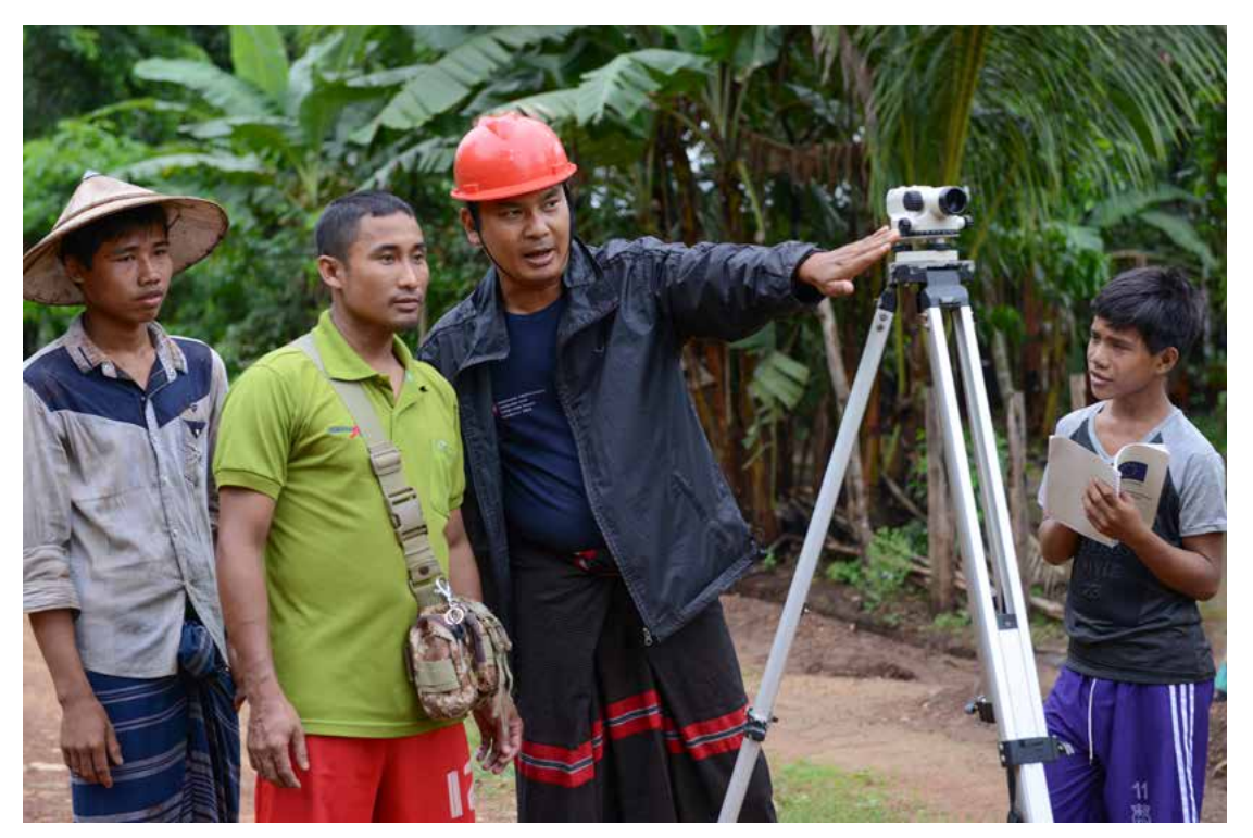
Levelling water supply system in Mon State

A mid-term review of this programme is planned for early 2021 following the adoption of the new Federal Dispatch on International Cooperation 2021-24 and Myanmar's national elections planned for 2020.