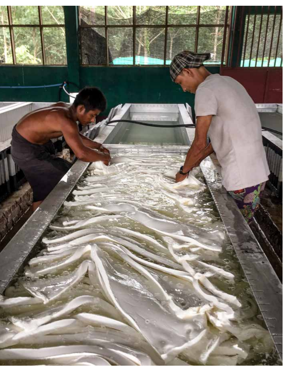
Latex sheets ready for the smoke house, © Markus Buerli / Embassy of Switzerland in Myanmar

Under the Swiss Cooperation Strategy Myanmar 2013-2017 (extended through 2018), Switzerland contributed to political, social and economic transition in Myanmar and, in turn, to a peaceful, inclusive and equitable society. With a total programme expenditure of CHF179m, Switzerland supported four areas of intervention: vocational skills development (15%); agriculture and food security (31%); health,