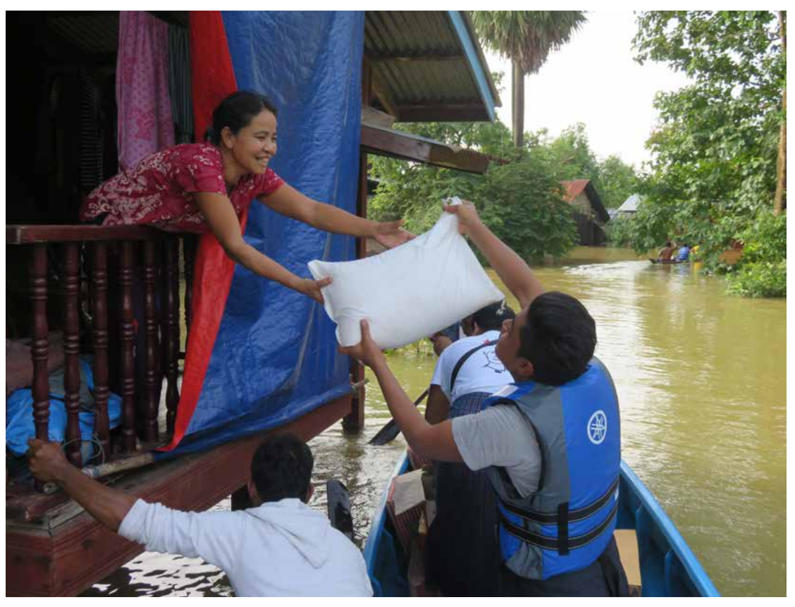
Emergency response for flood victims organised by SDC/HA in Mon state

men complete secondary level education. As for the labour force, 51% of women participate compared to 85% of men. Myanmar's gender gap in legislators, senior officials and private sector managers remains wide, ranking 88th in the Gender Gap Report 2018.