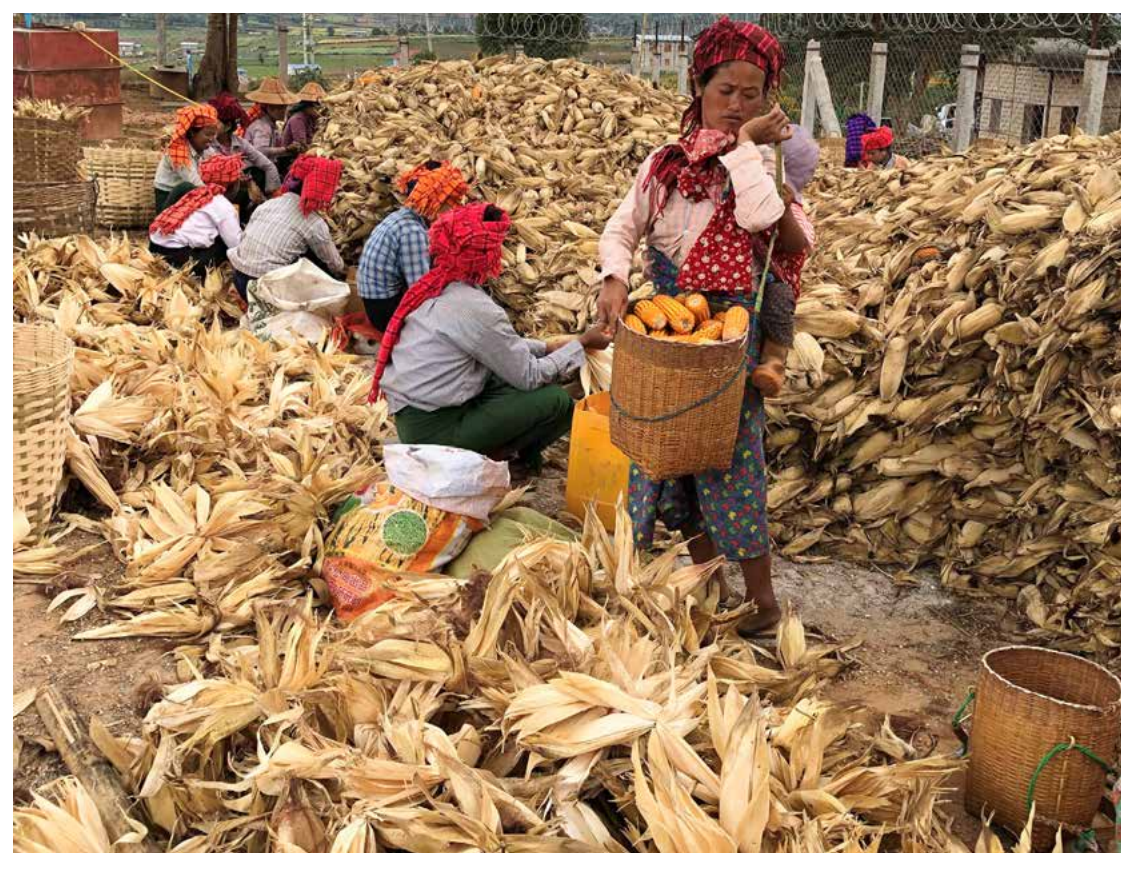
Women dehulling maize in Shan state