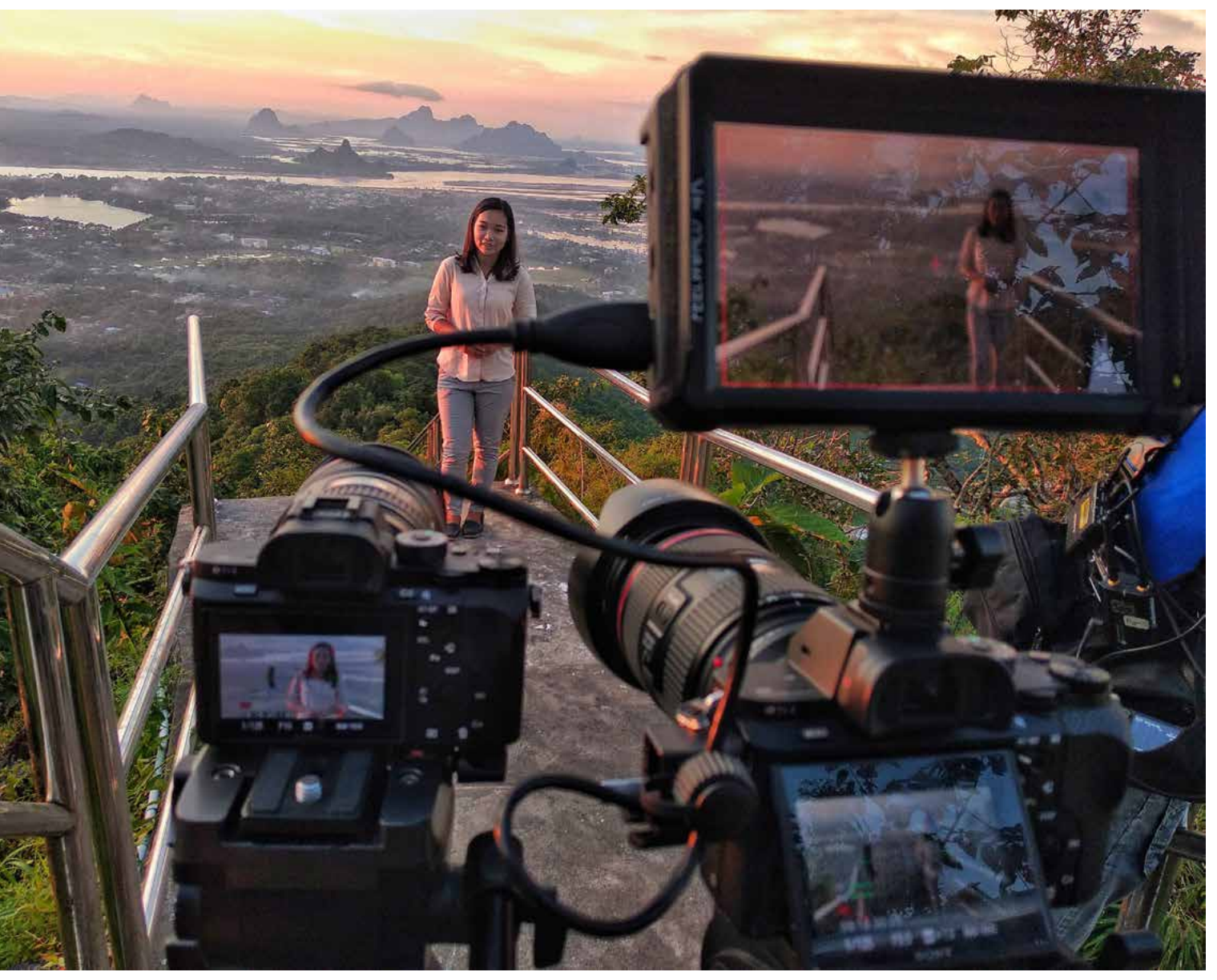
Recording for the peace-related TV show "Khan Sar Kyi", Kayin State, © BBC Media Action