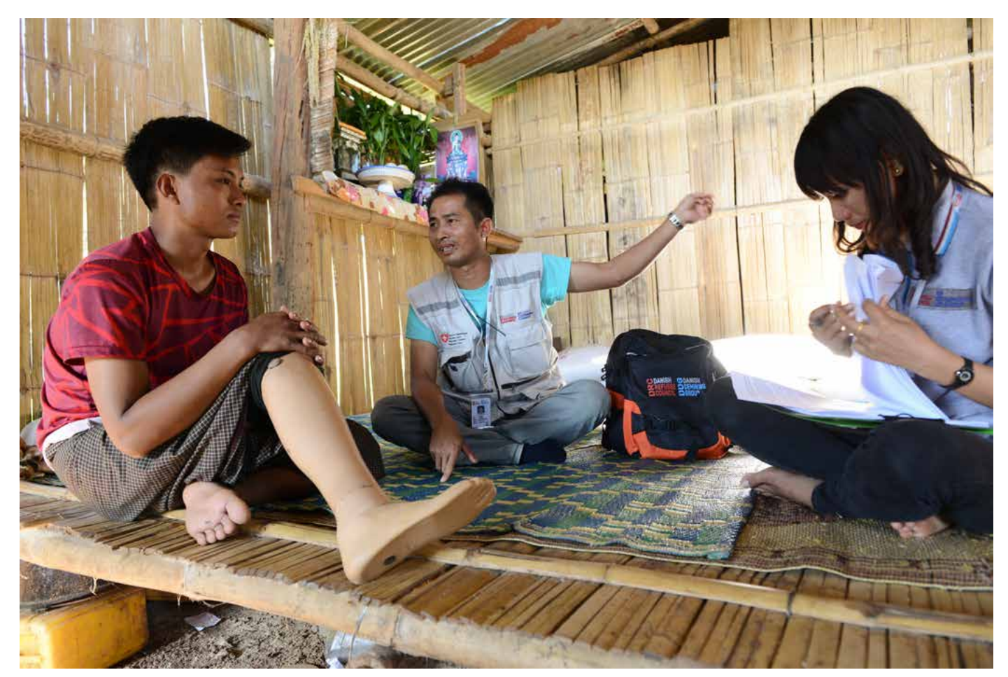
Land Mine Victim assistance in Shan State