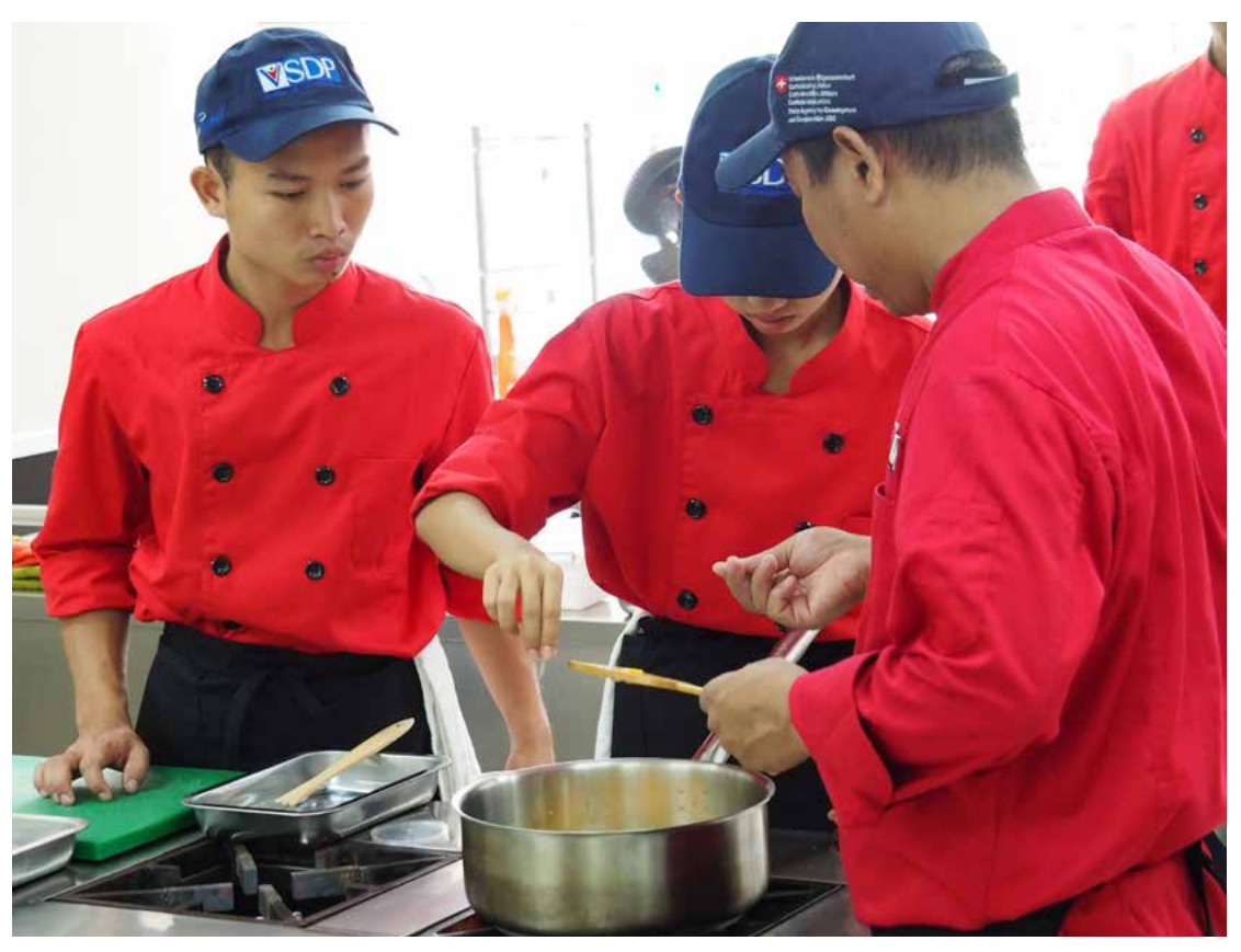
Cook apprentices learning how to braise meat, © Saw Vincent Phone Mya / Swisscontact