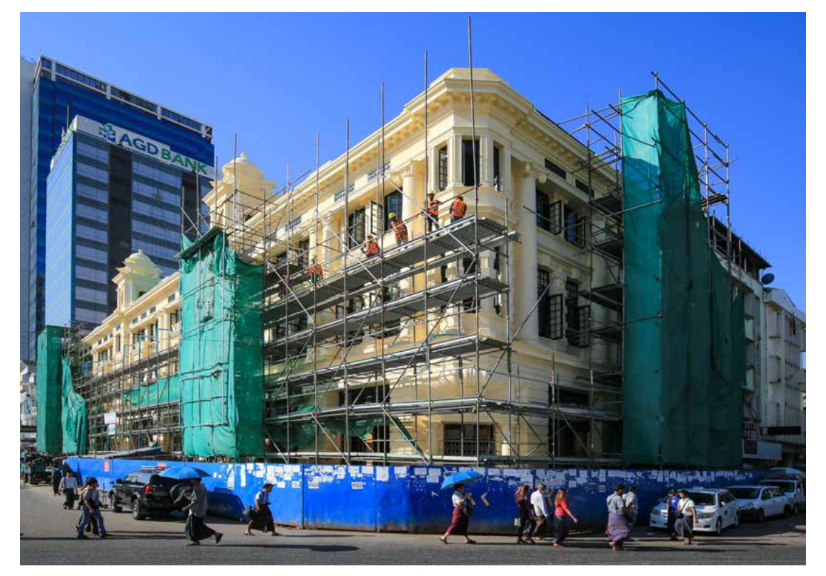
Restoration of a historic building in Yangon, © Nay Myo Zaw / Embassy of Switzerland in Myanmar

Provision of social services is being accelerated, including through the 2016 National Education Strategic Plan and the National Health Plan 2017-21. 15.8m people still live below the poverty line, 87% of them in rural areas; 14% of the population is undernourished and 29% of children under five are stunted. Myanmar still ranks only 148th out of 189 countries in the United Nations Human Development Index (2017). Despite progress, wide geographic disparities characterise access to social services. Drug abuse is widespread, especially in conflict-affected areas. Union-wide, Myanmar has achieved near gender parity in primary education enrolment, while more