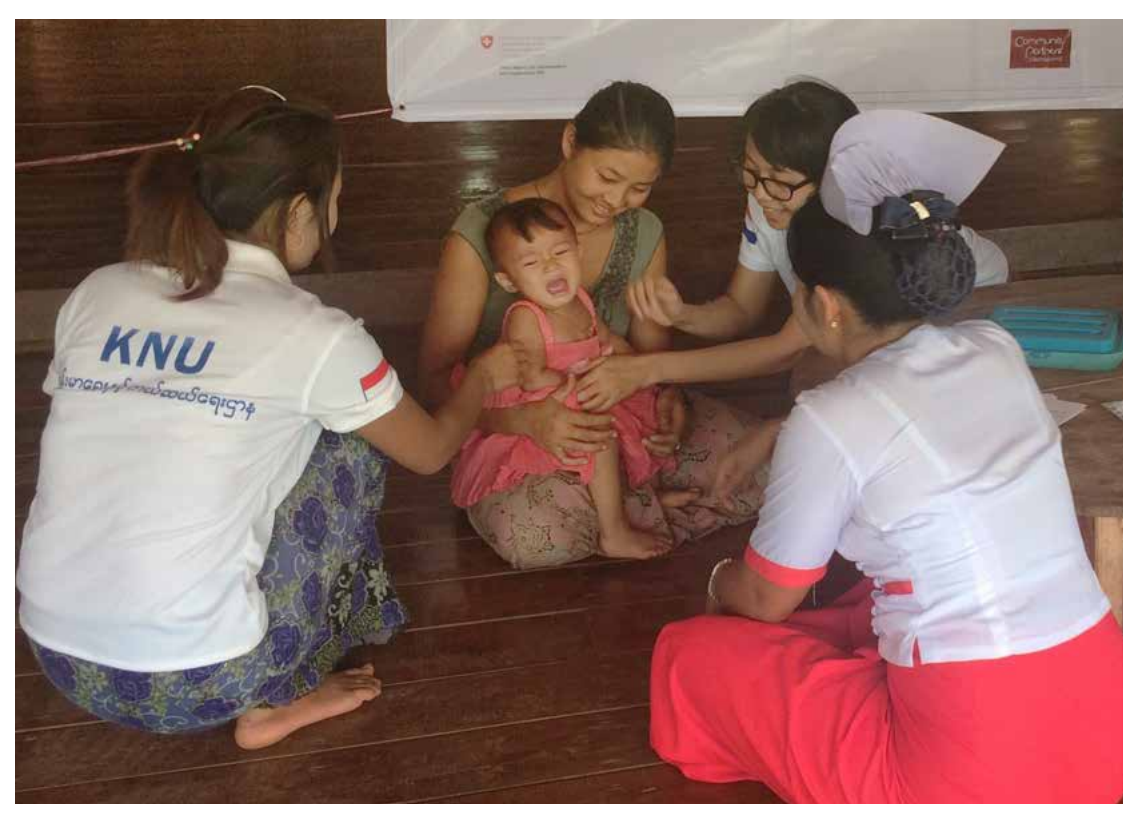
Karen Department for Health and Welfare and Ministry of Health and Sports jointly providing immunization to children in ethnic villages in Kayin state