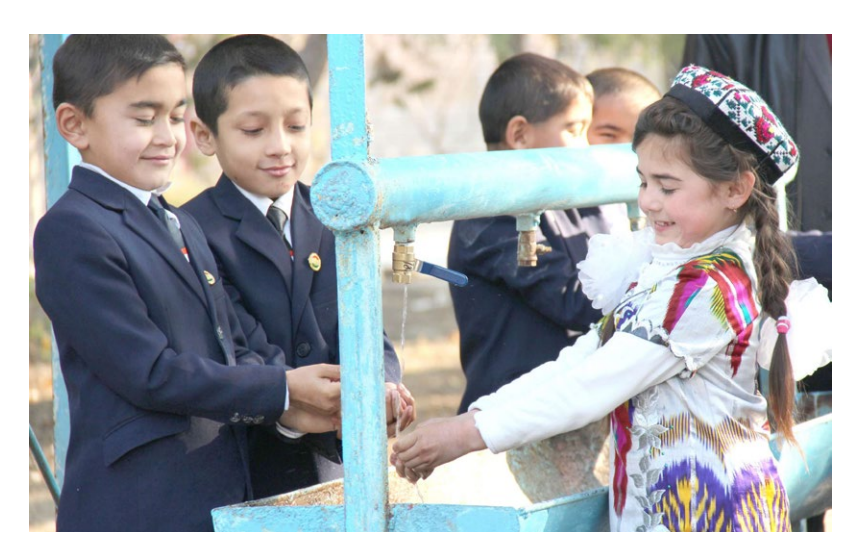
Water user associations provide access to drinking water in public places such as medical centres and schools.

In Tajikistan, the poorest country in Central Asia, half of the 8.5 million inhabitants do not have access to drinking water. In mountainous and rural regions, the figure reaches 80%. This situation poses a serious risk to public health. The SDC's project on 'Safe drinking water and sanitation management in Tajikistan' (SWSMT) focuses on access to drinking water and sanitation in the east of the country.