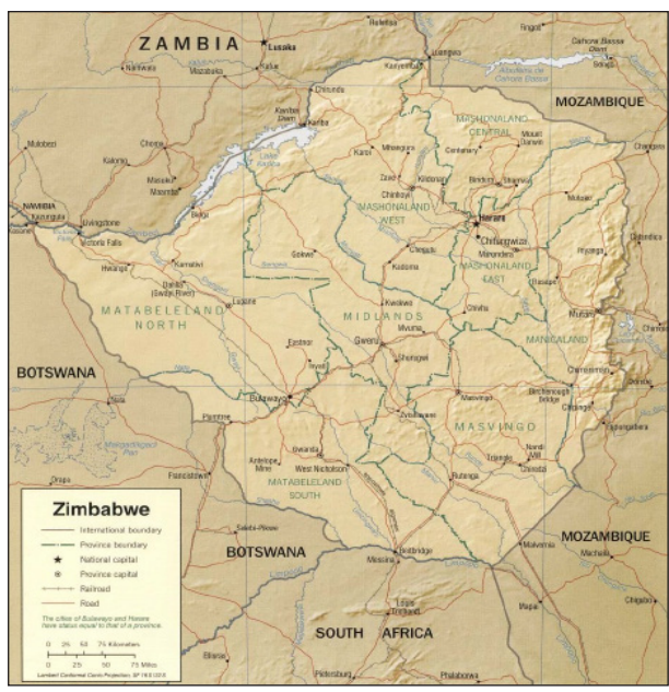
The boundaries and names shown and the designations used on this map do not imply official endorsement or acceptance by Switzerland.

Swiss Agency for Development and Cooperation SDC