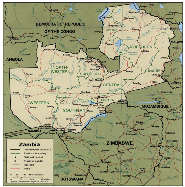
The boundaries and names shown and the designations used on this map do not imply official endorsement or acceptance by Switzerland.

Swiss Agency for Development and Cooperation SDC