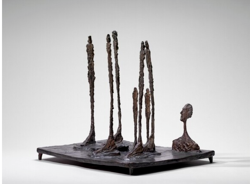
"The Forest", 1950, Alberto Giacometti, Source: National Gallery .