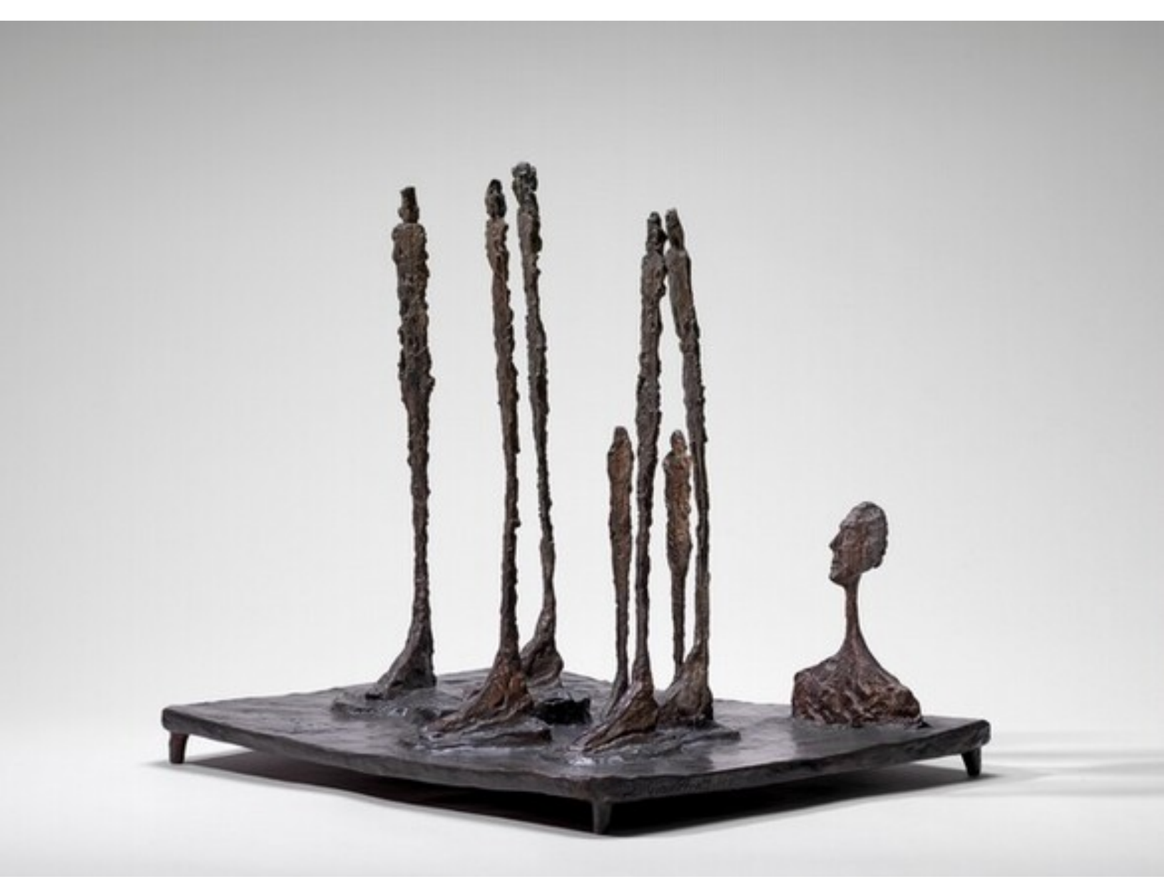
"The Forest", 1950, Alberto Giacometti