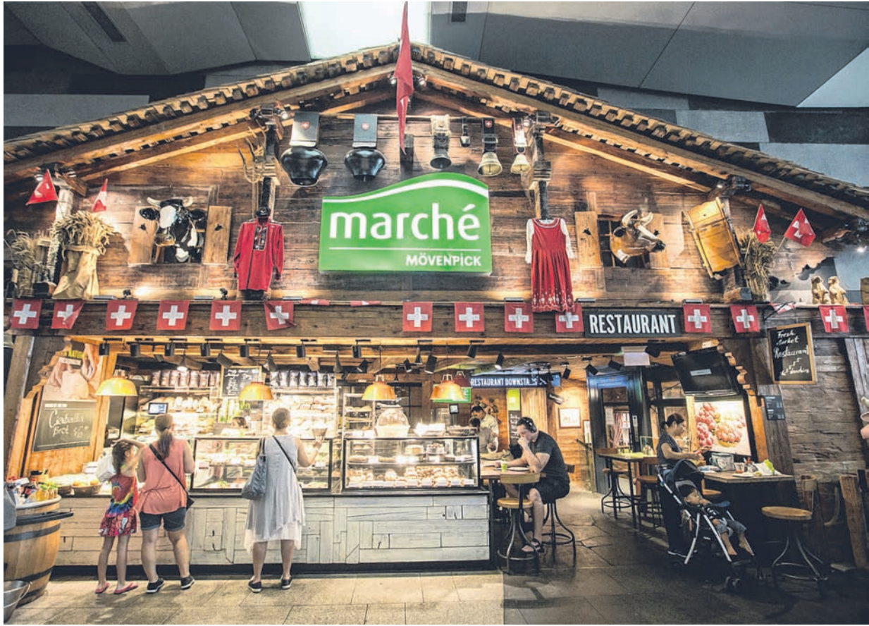
Marche has a structured training programme and various learning opportunities for the staff despite being a small company.

Asked why in his view excellence and skills training are important for businesses, he is of the opinion that investing in people is an investment for success. "When employees feel inadequate or unsupported, it could