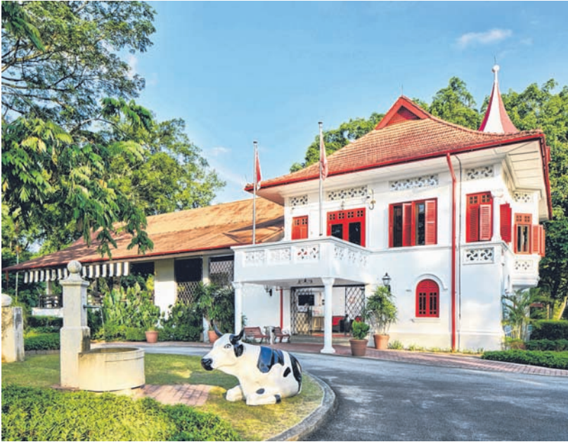
The main clubhouse, built in "chalet style", was completed in 1927. Its red and white features provides tranquility and stimulates the imagination of the colonial days.

"At 50, happily married to a Japanese lady, I am the proud father of a new-born son – and the life journey has taken yet another exiting turn. Hope to meet you during the Swiss National Day celebration at the Swiss Club!"