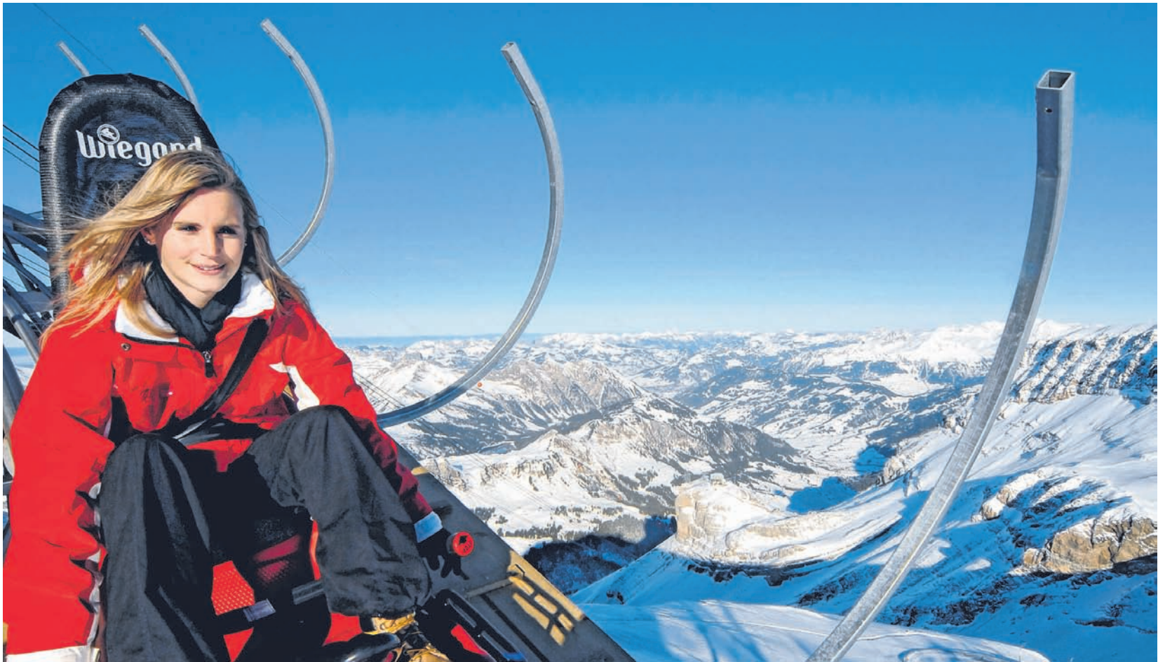
(Anticlockwise from above) Cool off in the refreshing waters of Swiss lakes in the summer; try a day of skiing in the winter; train travel can be made easy with a single ticket, using the Swiss Travel Pass; take part in a watchmaking workshop.