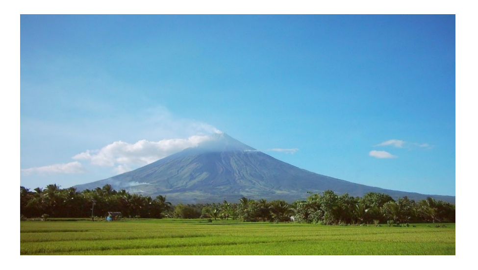
WHAT IS A VOLCANO AND WHAT IS A VOLCANO ERUPTION?

A volcano is a mountain that opens downwards to a reservoir of molten rock below the surface of the earth. Unlike most mountains, which are pushed up from below, volcanoes are built up by an accumulation of their own eruptive products. When pressure from gases within the molten rock becomes too great, an eruption occurs. Eruptions can be quiet or explosive. There may be lava flows, flattened landscapes, poisonous gases and flying rock and ash.