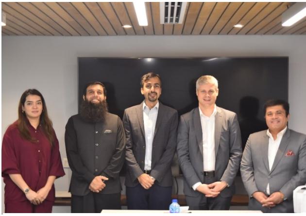
A group photo with the management of ABB Pakistan.