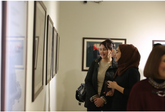
The participants enjoying the exhibition at PNCA.