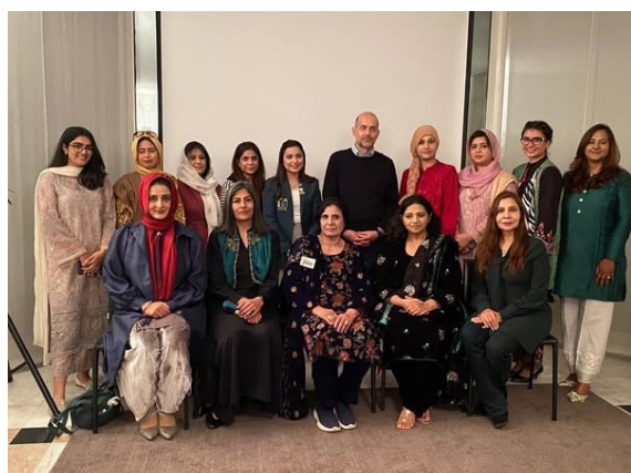
Group Photo with Women Climbers on International Women's Day.