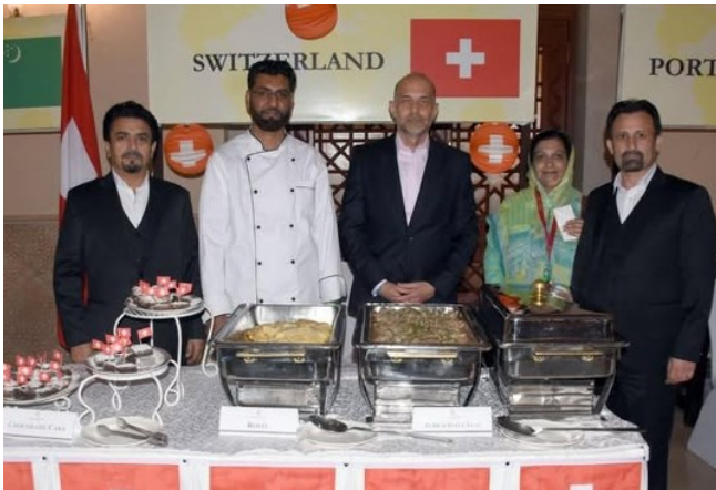
Swiss Food Stall at the charity event.

In May 2025, the Embassy of Switzerland and 27 other missions collaborated with the Pakistan Foreign Women's Association for a charity event to support girls' education and underprivileged communities in the country. The event, "Taste the World," featured cultural stalls and a variety of delectable delights at Serena Hotel Islamabad. Everyone present enjoyed the wonderful variety of foods on display and shared cordial moments together.