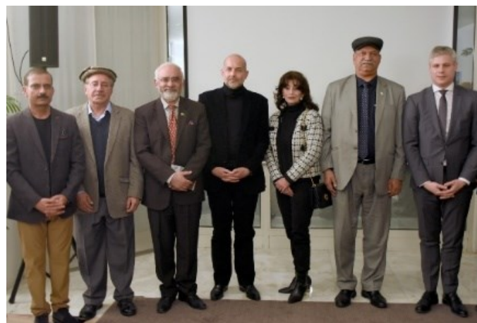
Group Photo with distinguished guests .