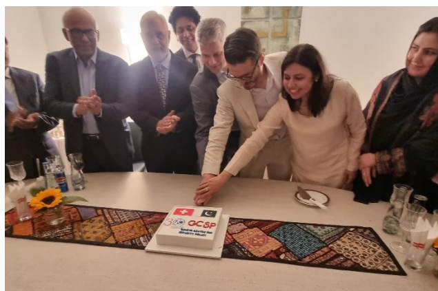
A symbolic moment of togetherness: the cutting of the anniversary cake.