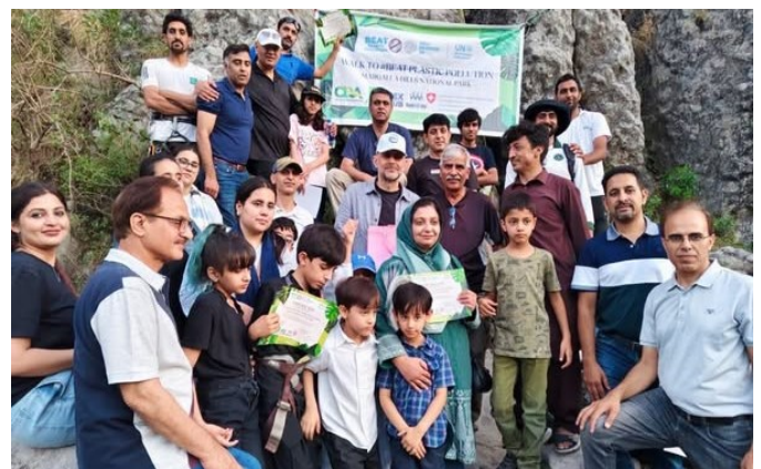
Group Photo with the participants of Plastic Waste clean-up drive and eco-climbing competition.