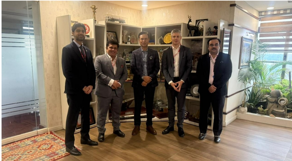
A group photo with the management of PARCO Gunvor