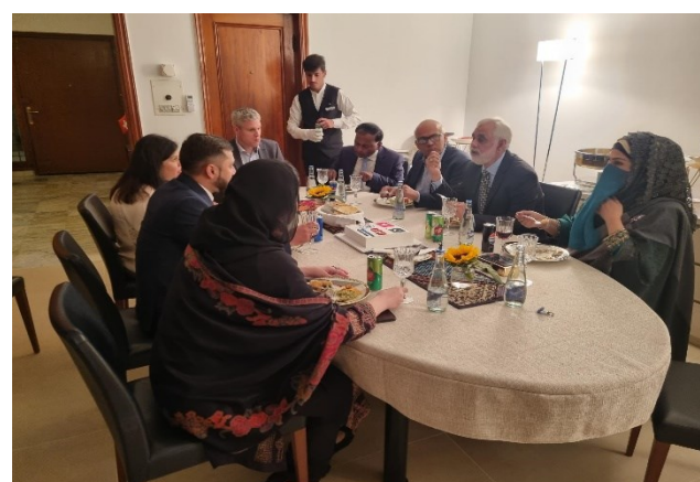
One table, one dialogue – living the GCSP spirit.