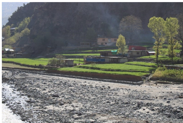
The Embassy of Switzerland and Helvetas Small Action Project in Upper Dir, KP.

Implemented by Helvetas Swiss Intercooperation Pakistan, this project aims to rehabilitate and upgrade damaged irrigation and protective structures to restore agricultural productivity, stabilize vulnerable slopes, and strengthen community resilience. The planned works include rehabilitating approximately 2,370 feet of irrigation channels, reconstructing 50 feet of flood-damaged headwalls, and constructing 80 feet of retaining walls to prevent erosion and safeguard farmland. This focused scope enables the project to deliver tangible results within a short period while ensuring quality and long-term sustainability.