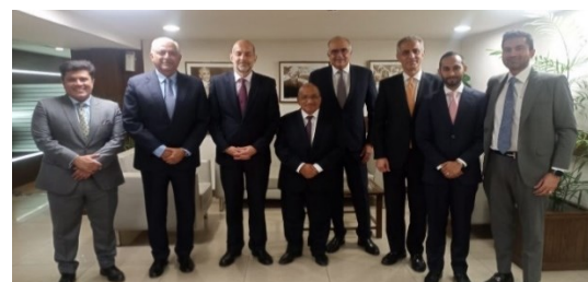
A group photo with the management of Habib Metropolitan Bank.