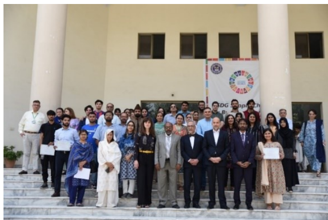
Group photo with faculty and students from the National University of Modern Languages.