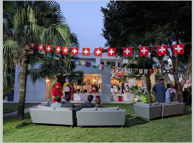
Swiss National Day 2025 at the Residence of the Ambassador of Switzerland.