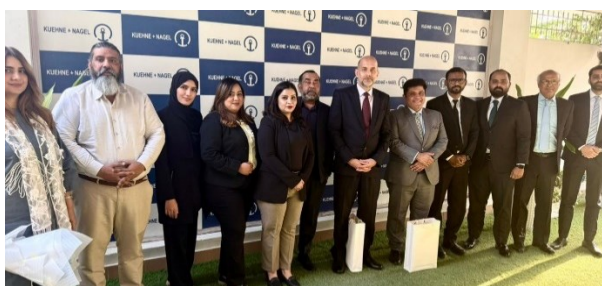
A group photo with the management of Kuehne+Nagel.