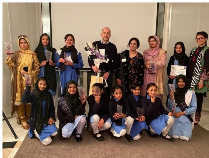
Group Photo with winning Young Women Climbers at the Residence of the Ambassador of Switzerland on International Women's Day.