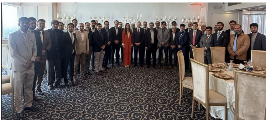
A group photo with the members of Swiss Business Council.