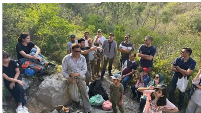
CEO of Adventure Club-Pakistan with participants of eco-climbing competition.