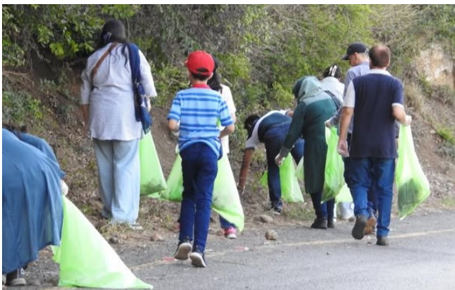
The staff of the Embassy of Switzerland with Adventure Club Pakistan collecting plastic waste at the Margalla Hills to help overcome plastic pollution.