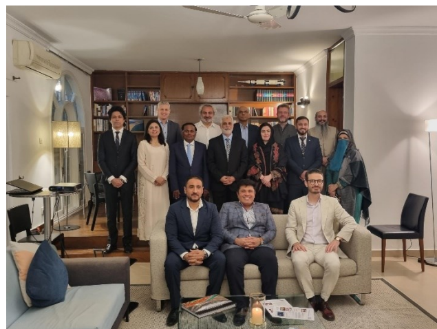
Global Alumni Networking Night (GANN) in Islamabad.

The ceremonial cutting of the anniversary cake marked the symbolic highlight of the evening, as participants continued their conversations in a warm and open atmosphere – reflecting the GCSP's three decades of fostering global connection.