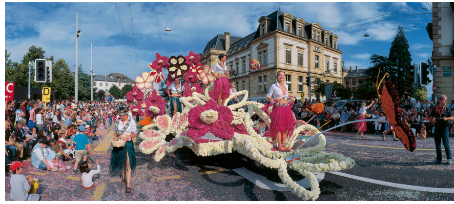
The wine grower's festival is held each year at the end of September. The vintnermaidens (les Miss des vendanges) on a flowerwagon.