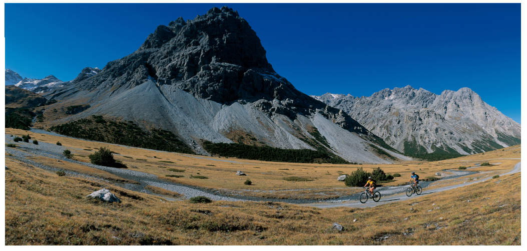
Bikers at Val Mora in the Swiss National Park, Canton Graubuenden.