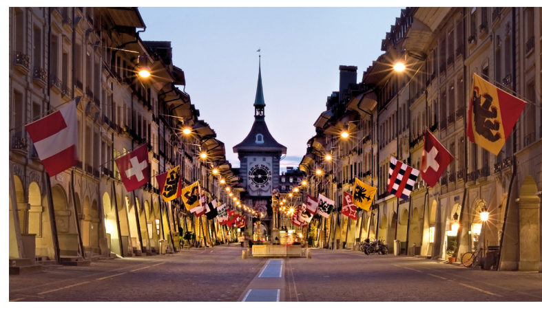
Kramgasse with flags and lighting, Bern.