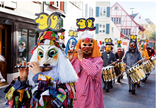
The Basel Carnival - fife and drum music put on by masked bands marching through the Old Town.