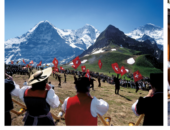
The Maennlichen (2343 m) in the Bernese Oberland. A festival of traditional costumes close to the Tschuggen. Eiger, Moench and Jungfrau can be seen in the background.