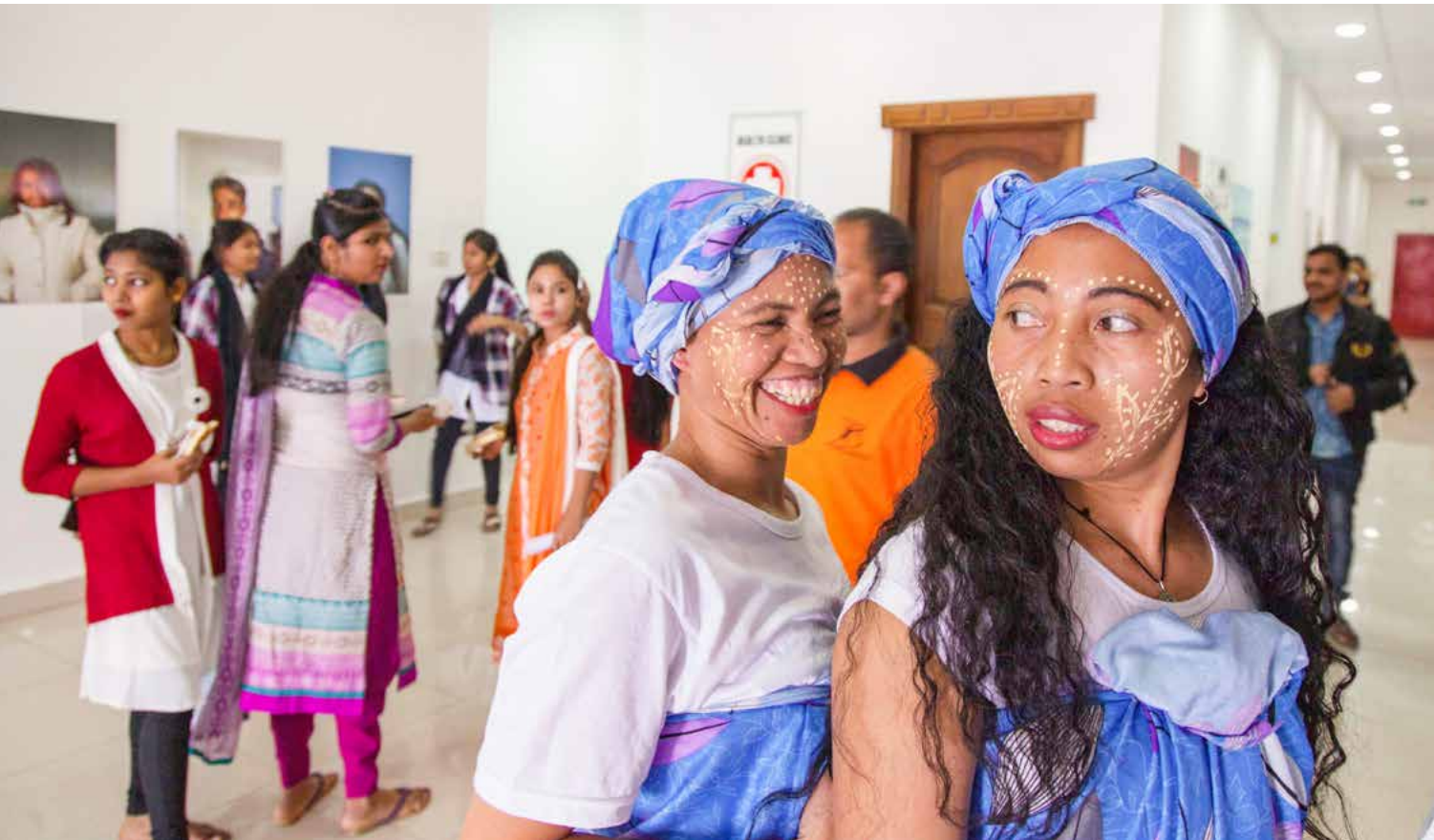
Worker's Center supported by Switzerland's Global Programme for Migration and Development, Al Hassan Industrial Zone, Irbid, Jordan.