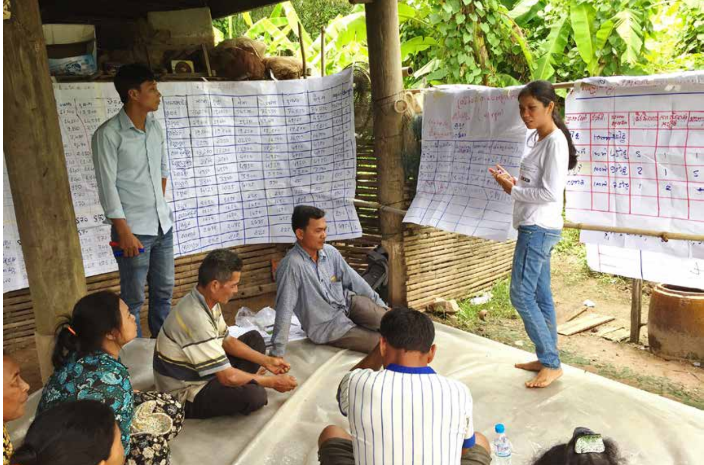
Business development meeting where farmers, traders and local authorities discuss the next steps of their business plans in Stung Treng, Cambodia.