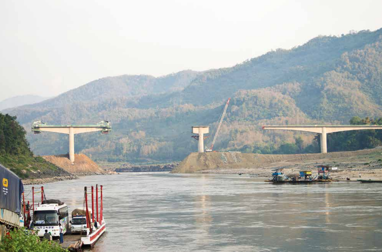
Mekong river bridge to replace ferry crossing in Xayaburi, Lao PDR.

good water governance to meet electricity and irrigation needs are an obvious challenge in the region, as well as land disputes and the extensive presence of landmines in Cambodia and UXOs in Lao PDR.