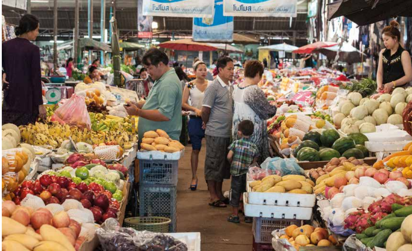
Open air fresh market in Vientiane Capital City, Lao PDR.

Due to the weak and non-binding nature of CLMV cooperation, regional interventions will whenever possible be implemented by a regional or international institution serving as integrative platform. Being the most important regional body, a closer cooperation with ASEAN will be established. Joint development activities with ASEAN should form an important component of the newly established Sectoral Dialogue Partnership and allow for the promotion of south-south cooperation.