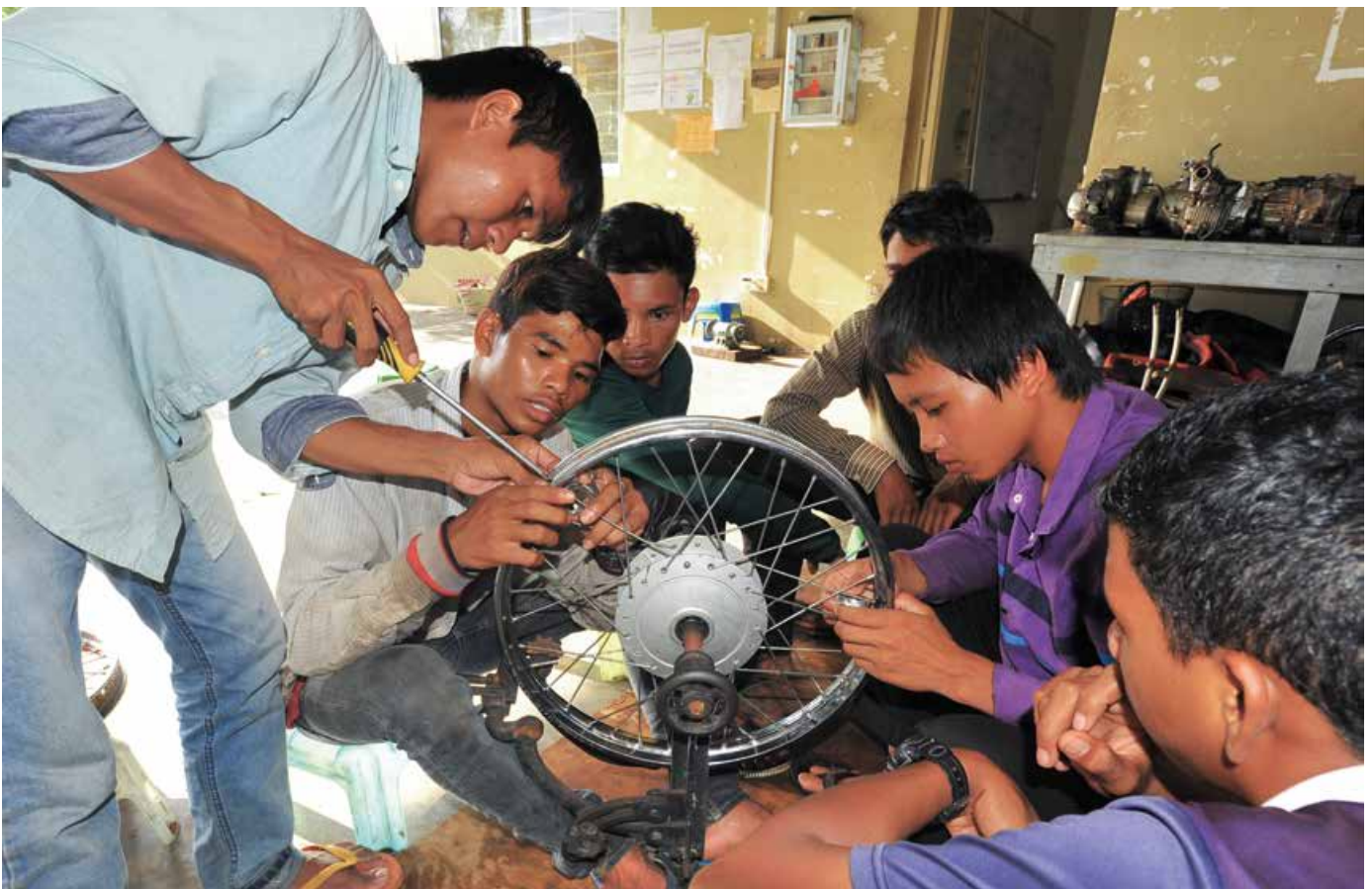
Motor bike repair training in Preah Vihear, Cambodia