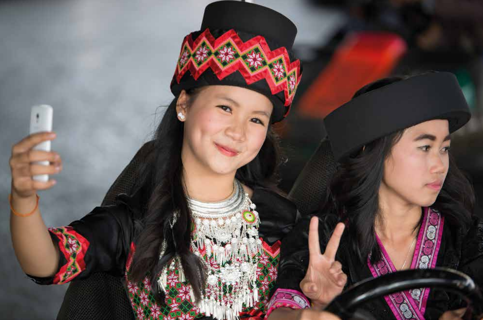
Hmong New Year festival celebrating diversity in KM52, Vientiane, Lao PDR.