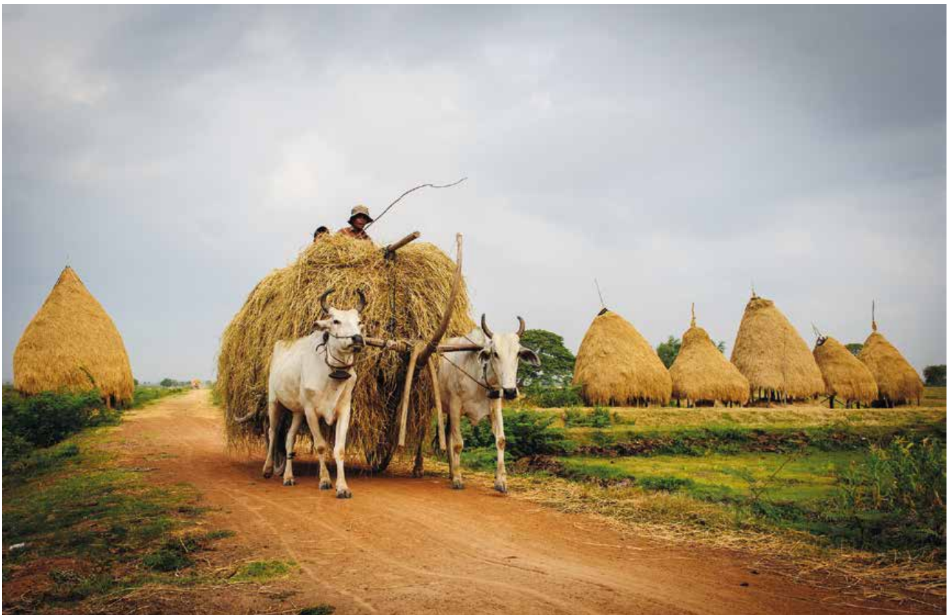
Rice farmers in Kandal province, Cambodia.