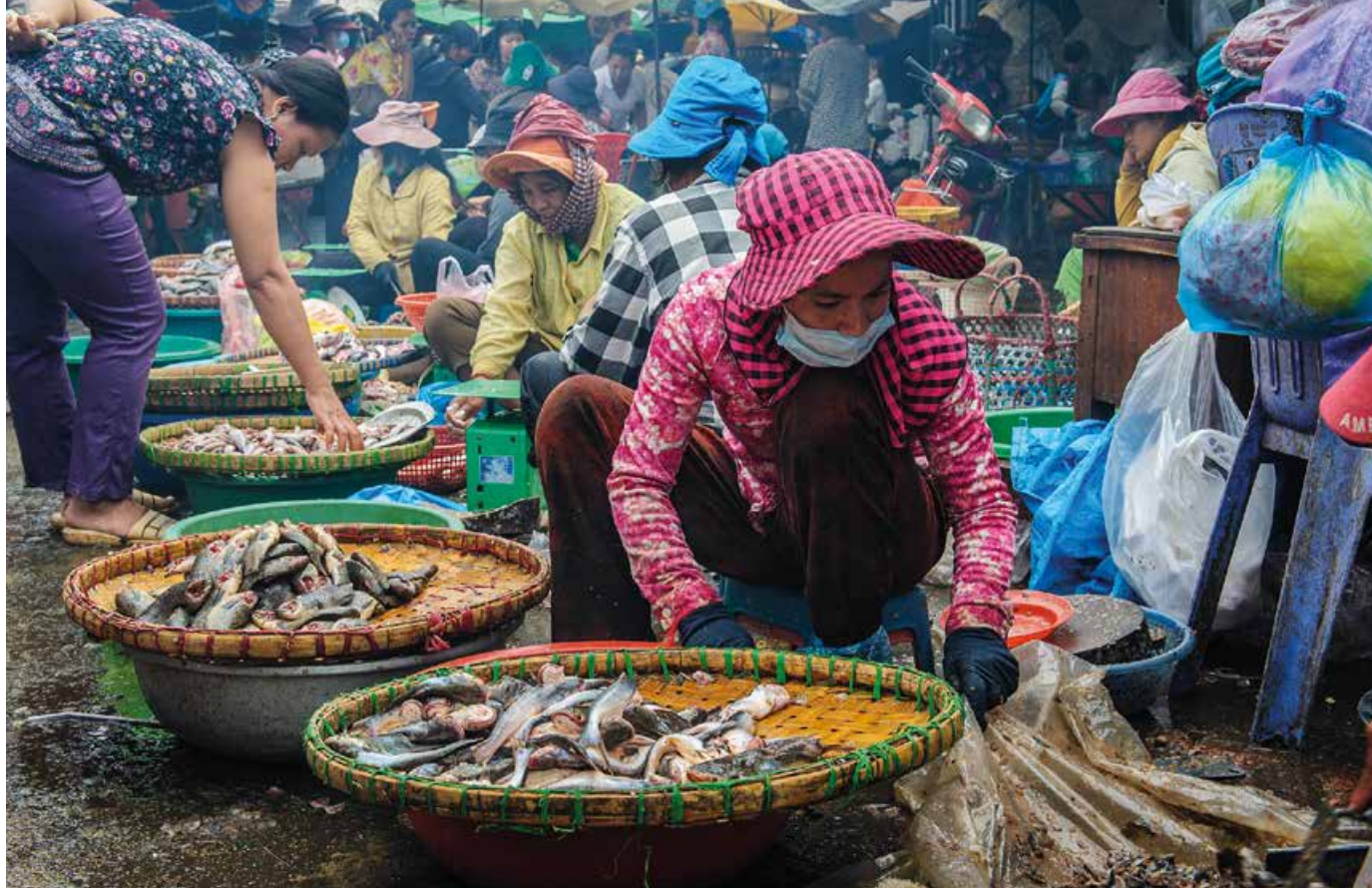
Fish market in Kratie, Cambodia.