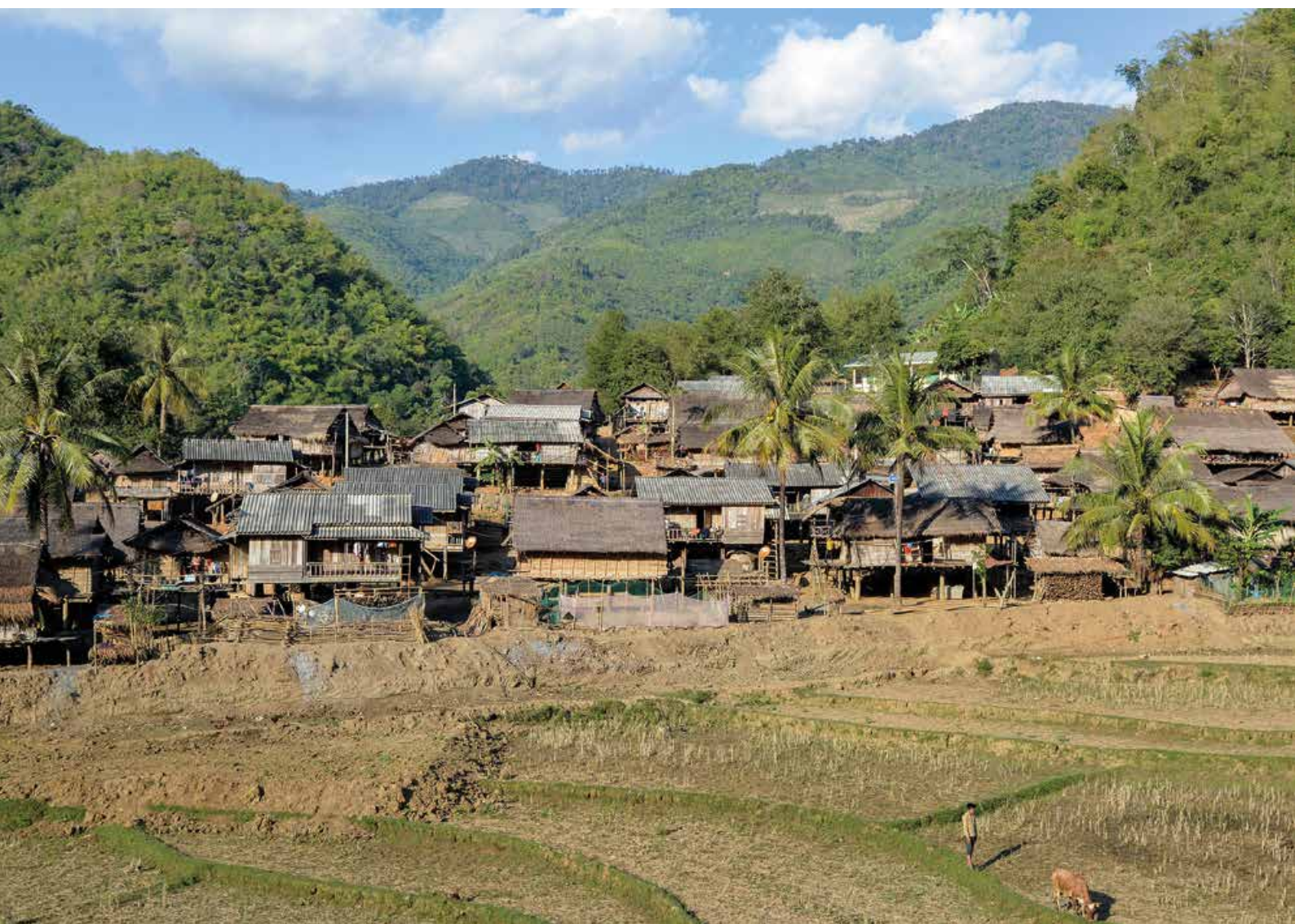
A nutrition improvement focus village in Houaphan, Lao PDR.