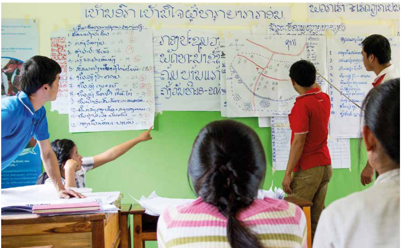
Pacticipatory village planning in Luang Prabang, Lao PDR.