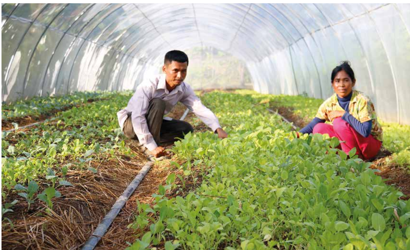
Horticulture farmer in Preah Vihear province, Cambodia.

The regional approach will keep its focus on CLMV, while continuing to work in other countries of the region where this is conducive to achieving the overall goal of building inclusive societies in CLMV. A larger-scale regional approach can be more effective than national projects – e.g., on topics with transnational aspects such as water management or land investments. The regional project portfolio will therefore be further strengthened in terms of relevance and quality.