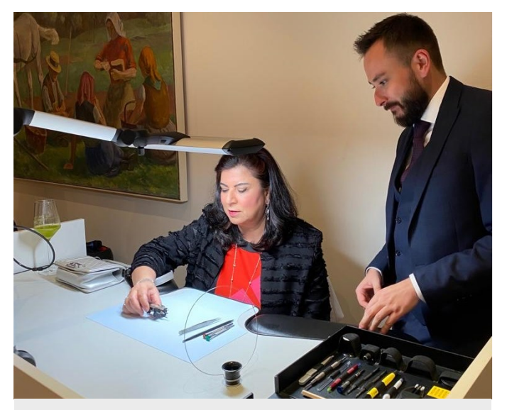
Swiss watchmaker (right) who flew in from Switzerland especially for this event showing the process of Swiss-precision watch-making to one of our distinguished guests.

how to dismantle and reassemble the workings of a mechanical watch!