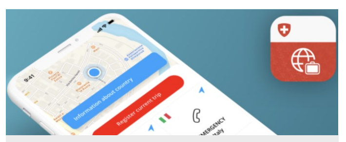
FDFA services and useful information at the touch of a finger, both before and during the journey: Travel Admin.

This web application enables the Swiss abroad to receive and find important information from their official representation, the various federal offices and other institutional partners in a single, state-of-the-art platform. The application complements existing communication platforms, such as the consular services, the FDFA's virtual counter and Travel Admin, the companion for Swiss travelers. No registration is required. However, you will need to create an account to access certain additional functions.