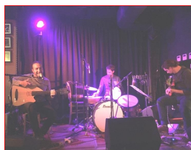
"ab3ad" group playing at the Maestro restaurant

"ab3ad" creates an intense and deeply spiritual music. With their recent work titled:" Ancient love -Alte Liebe – قديم حب, they honor love from the past, but not so much looking back on lost romance, but revisiting people and places with their sounds and perfumes and atmosphere. It reflects on how the memories of these crucial old and sometimes even