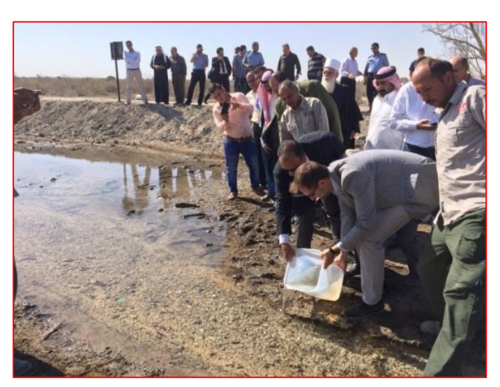
The Regional Head of Cooperation and the RSCN representative release Killifish Fish into the newly inaugurated pool

Switzerland is supporting Jordan through its international cooperation with an overall contribution of over 20 million JOD in 2016. One of the key domains of intervention concerns the water sector where SDC aims to link sustainable water resource management with equitable access to water and sanitation services.