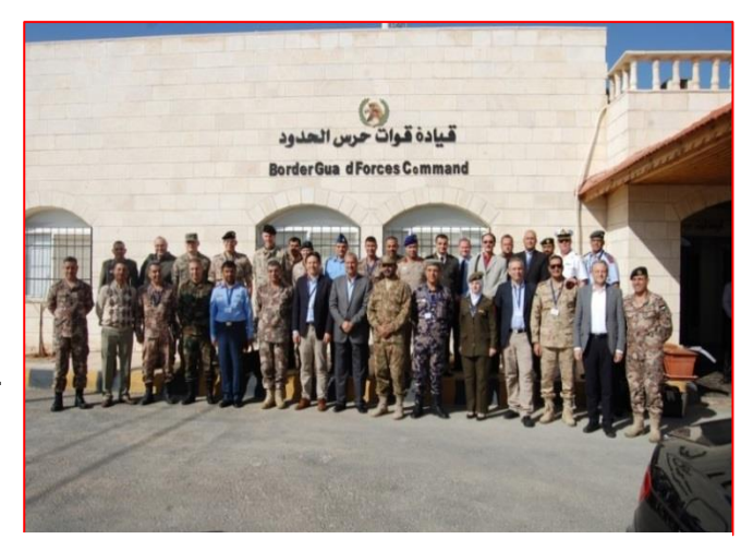
Participants at the 10<sup>th</sup> training course in diplomacy and security policy

Other panelists analyzed the global security environment and future challenges that might