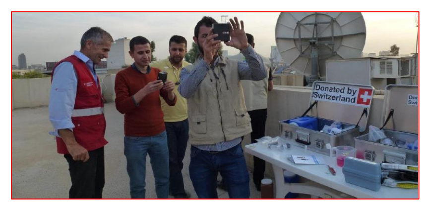
A member of the SHA unit provides training on the delivered equipment, Erbil, 9th November 2016

The second project is an additional support worth 1 million Swiss Francs to the International Committee of the Red Cross operations in Iraq. Finally, a third intervention was through deploying a member of the SHA unit to UNICEF in Iraq to coordinate the response in the water, sanitation and hygiene sector. Taking these recent measures into account, Switzerland's support in response to the Iraq crisis amounts to more than 11 million Swiss Francs in 2016.