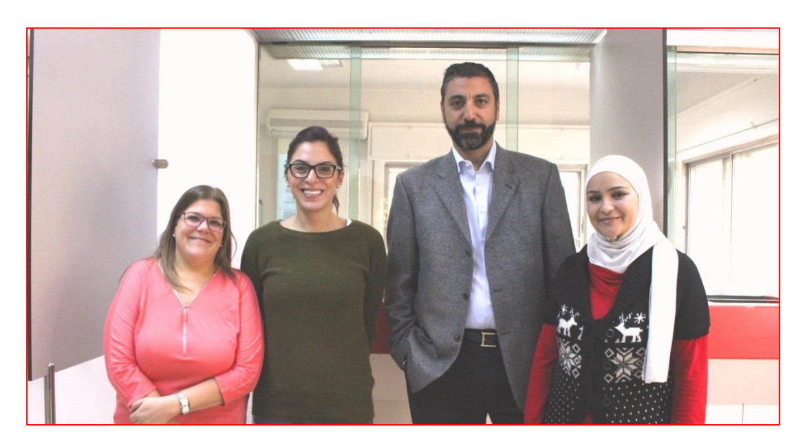
Consular section team

The consular section remains at your disposal in case you need further information on this matter and all the team wishes you pleasant winter holidays!