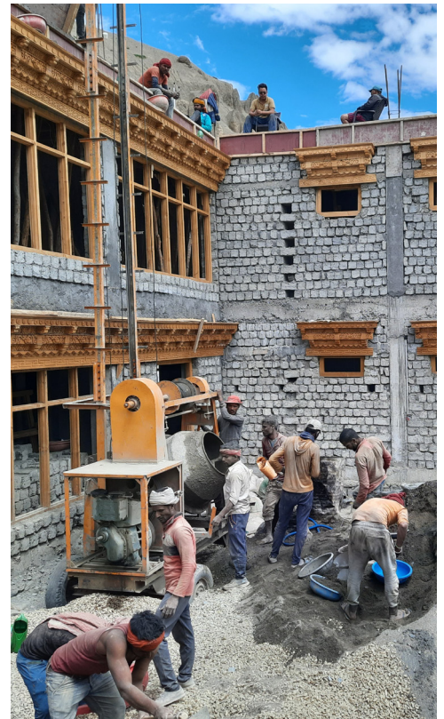
All pictures @SDC