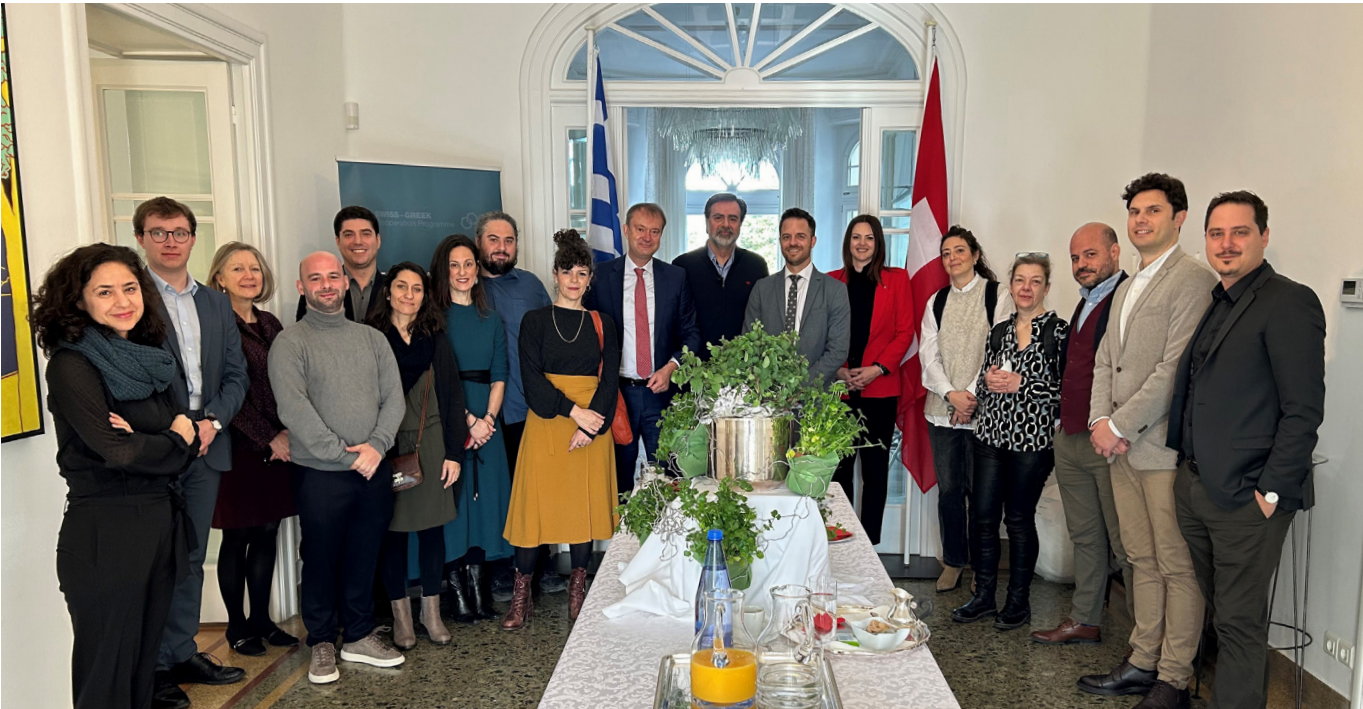
Participants of the Roundtable and Networking event