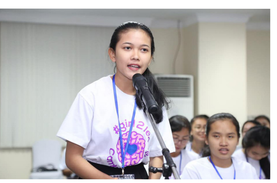
Student participant in the #Girl2Leader Cambodia campaign hosted by the Cambodian Women Parliamentarians Caucus and supported by PCAsia.