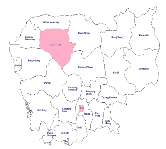
Target provinces highlighted in pink colour

While the Kantha Bopha hospitals are open to everyone, the project focusses its support to 1) children (<15 years) and expecting mothers in Cambodia; 2) accompanying caregivers of patients and 3) Cambodian health personnel (doctors and nursing staff). The hospitals are located in Phnom Penh and Siem Reap.