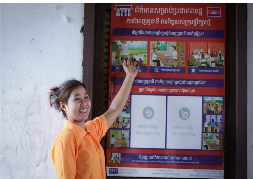
Community Accountability Facilitator presents service standards for communes