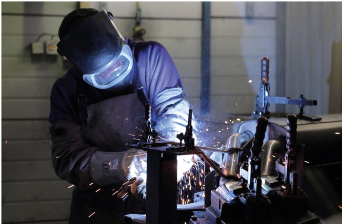
Education is a critical success factor to improve people's opportunities on the labor market. The diaspora can contribute to economic development through transfer of skills and know-how, and by investing in businesses in Bosnia and Herzegovina.