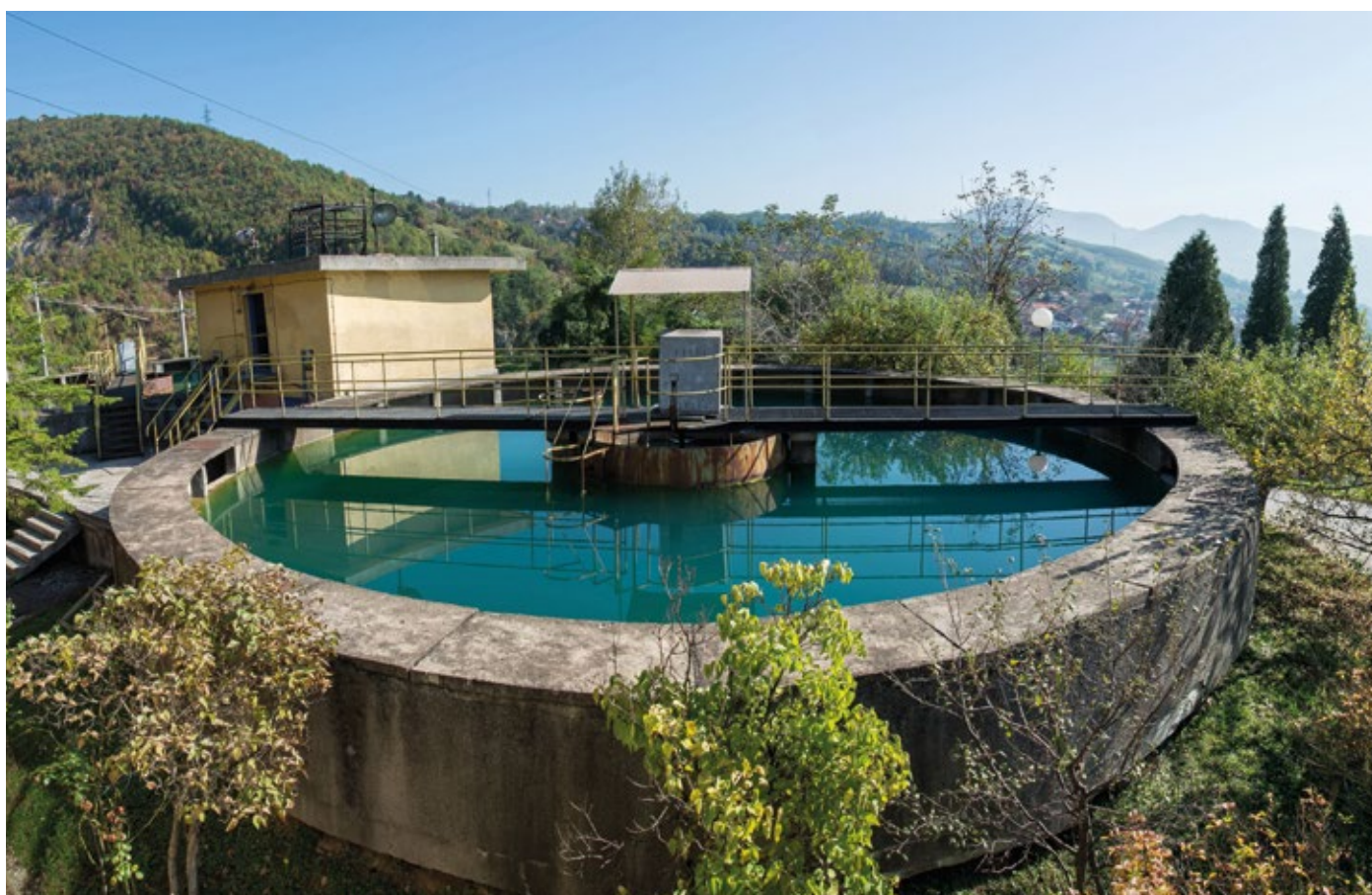
Drinking water for Zenica is extracted from Babina river and treated in this plant. The water supply system of the city is under rehabilitation in a joint project by Bosnia and Herzegovina, Germany and Switzerland.