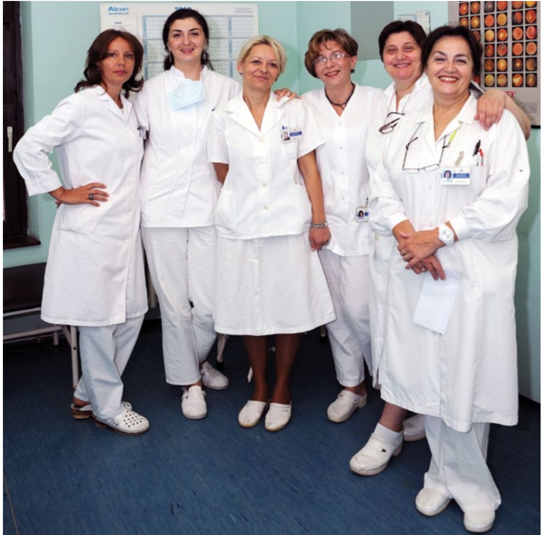
Nurses are trained to provide safe and high quality services to the population all over Bosnia and Herzegovina.