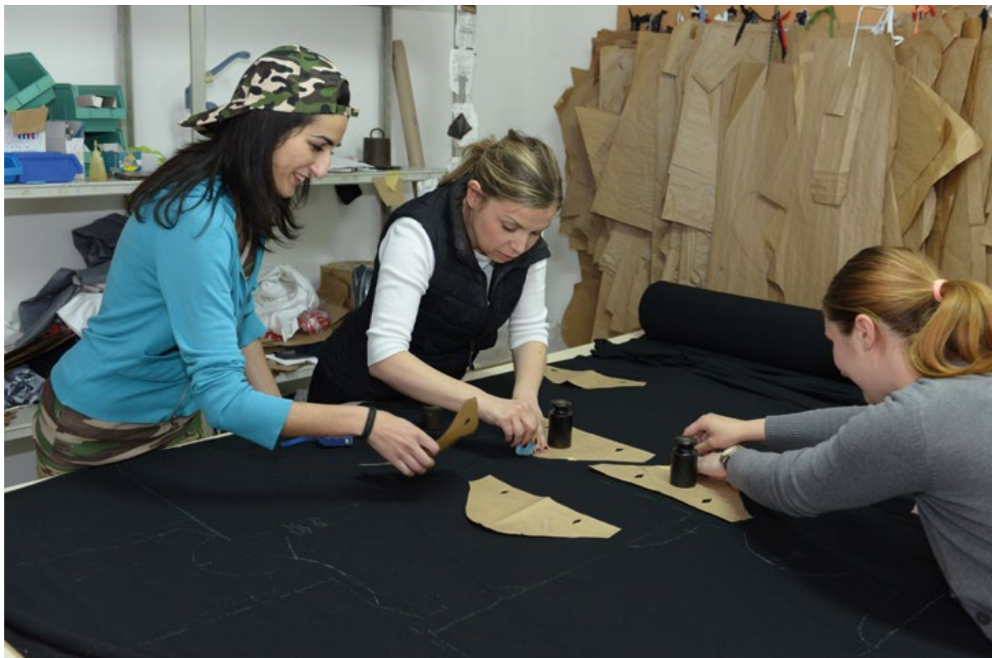
Young people design and produce fashion in a social enterprise, where profits are reinvested in community projects.

Initiated by the European Union and backed by international financial institutions, a "Compact for Growth" initiative has laid the ground for stronger focus on reforms towards economic and social development in 2014. With the Stabilisation and Association Agreement entering into force in June 2015, and the adopted "Reform Agenda" and subsequent Action Plan in July 2015, more commitment was given to reforms regarding a business enabling environment, public financial management, labour market, social protection, rule of law and public administration. The critical financial situation of both entities in Bosnia and Herzegovina has paved the way for the signing of a stand-by agreement with the International Monetary Fund, and the agreement on a Co-ordination Mechanism to absorb pre-accession funds provided by the European Union. In recent years, real estate investors from Arab and Gulf states have increased their presence in Bosnia and Herzegovina, particularly in and around Sarajevo. While the investment is welcome, questions and concerns have emerged over the sources of such capital, non-transparent property sales procedures, and the impact of stricter Islam brought along towards local communities and society.