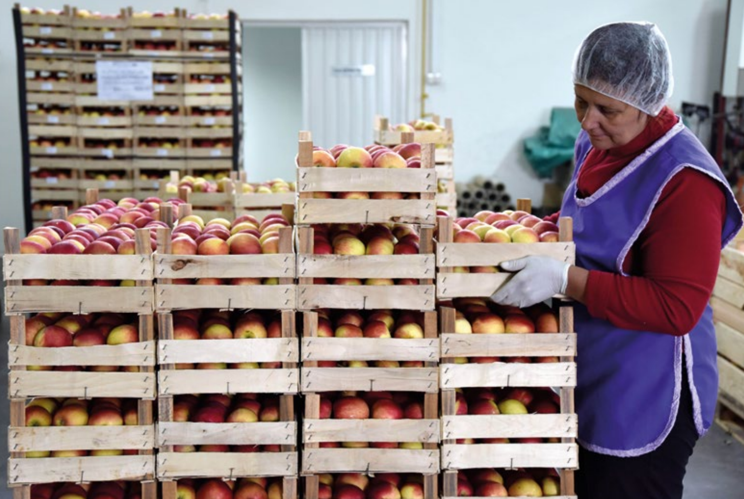
An employee of an agriculture cooperative in Gradačac prepares locally produced apples for delivery to Konzum, one of the largest retail supermarket chains in the region.