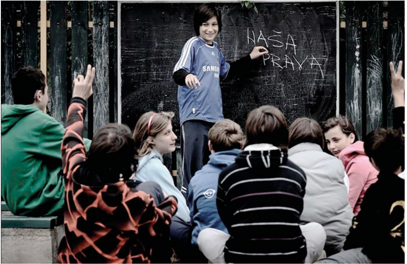
Children and young people in Bosnia and Herzegovina learn how to peacefully claim their rights ("naša prava").