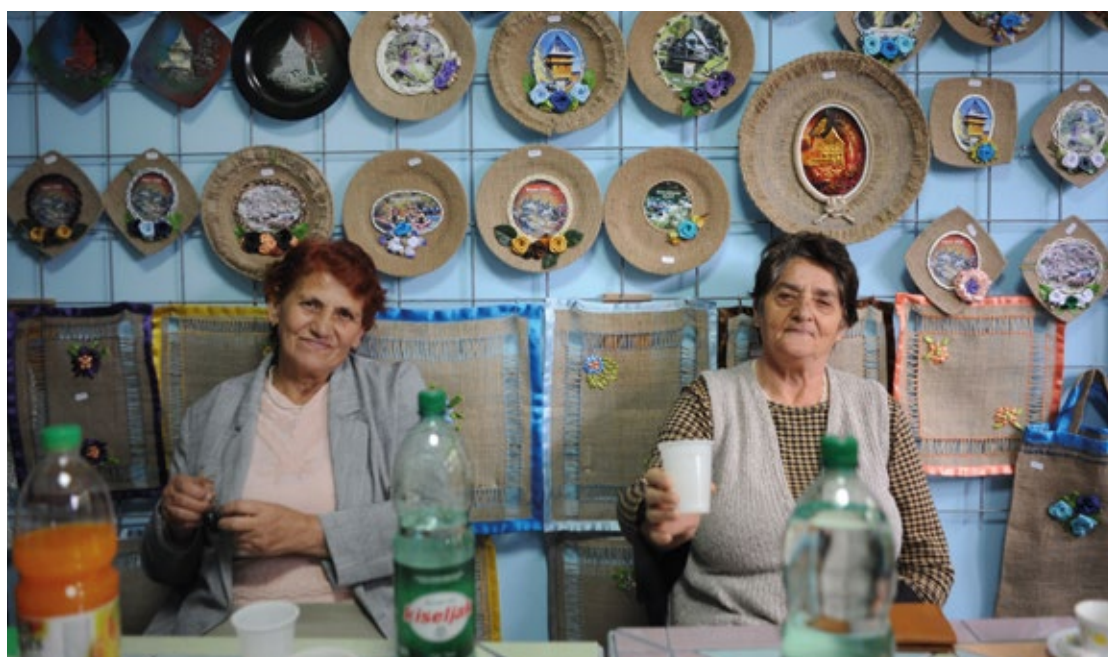
Occupational therapy helps persons with mental disorders doing their day-to-day tasks and enables them to integrate in their community.

local development planning are open for inter-municipal and inter-entity cooperation; their projects are likely to succeed and become sustainable, without need for further donor support. A legal framework defining the overall development management system has been adopted by the Parliament of the Federation of Bosnia and Herzegovina. Improved municipal governance and utility management, combined with some infrastructure investments, have triggered a multiple of additional investments within the same sectors. 23 municipalities are far advanced in developing the Business Friendly Certification process which will attract urgently needed investments from the private sector to create jobs and to generate public revenues. Over 200,000 citizens have benefited from revitalised public service delivery disrupted by the 2014 floods. New interventions including Disaster Risk Reduction measures have been prepared for the improvement of water supply and sanitation systems in two cities with a population of over 200,000 people. Gender Equality Mainstreaming has become an underlying principle in the new Law on Strategic Planning of the Federation of Bosnia and Herzegovina: in certain fields, over 60% of direct beneficiaries are now women.