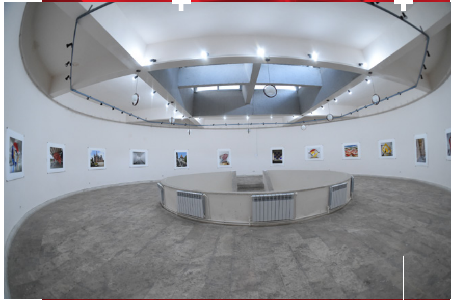
Quinze points de vue – Felice Varini

The Francophonie programme closed on May 3 with Swiss Artist Felice Varini's documentary exhibition at Hay Art Gallery. 15 large-scale artistic photos documented the artist's installations in cities and places around the world. Felice Varini explained his artistic concept and technique during two captivating presentations at TUMO and Mirzoyan library on May 2 and 4. The exhibition at Hay Art Gallery was also graced by the presence of RA Minister of Culture Hasmik Poghosyan. The Embassy is presently working to bring Felice Varini for a large-scale installation to Yerevan in 2017.