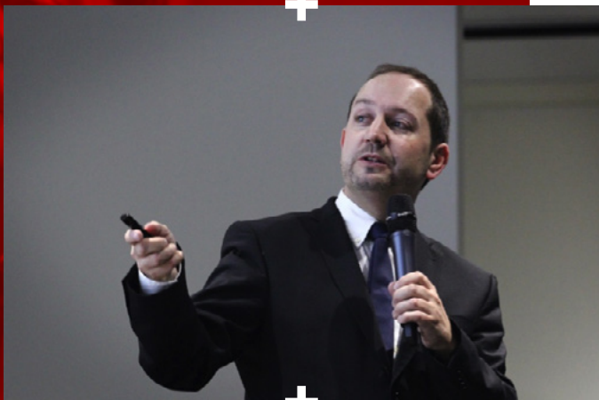
The Swiss way of making cities smart

A conference on the technological, economic and social aspects of how to make a city "smart" was held in teamwork with Impact Hub Yerevan on April 15. Experts and practitioners from Switzerland and France explained how urban services are improved in their cities thanks to information and communication technology. Yerevan, Vanadzor, Kapan or Dilijan? The potential is all here!