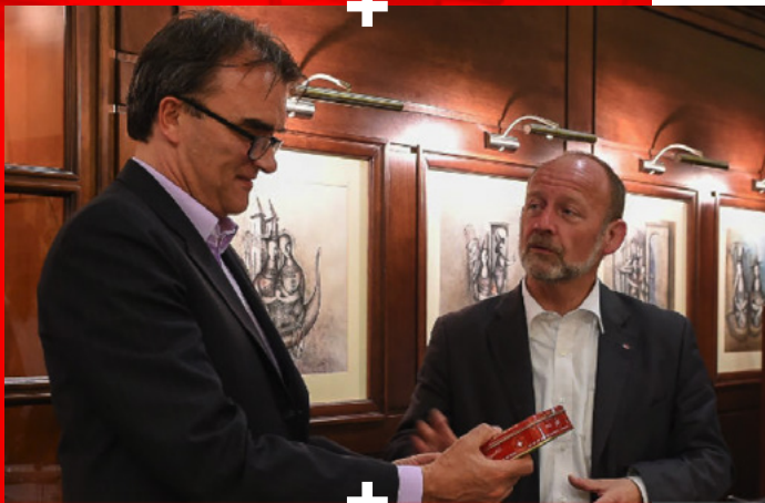
Parliamentary diplomacy – an important asset in our relations