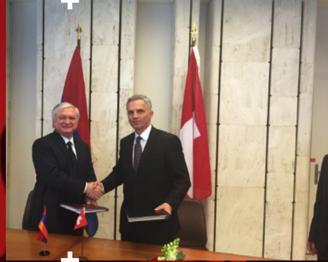
Agreement eases visa requirements for Switzerland

During their meeting in Geneva on February 29, 2016, Federal Councillor Didier Burkhalter and RA Minister of Foreign Affairs Edward Nalbandian signed a bilateral Visa facilitation agreement. The agreement, which entered into force in August 2016, provides for numerous facilitations in the Swiss visa regime for Armenian nationals. The Embassy of the Republic of Poland in Yerevan will continue to issue Swiss Schengen visas for Armenian nationals and persons residing in the Republic of Armenia.