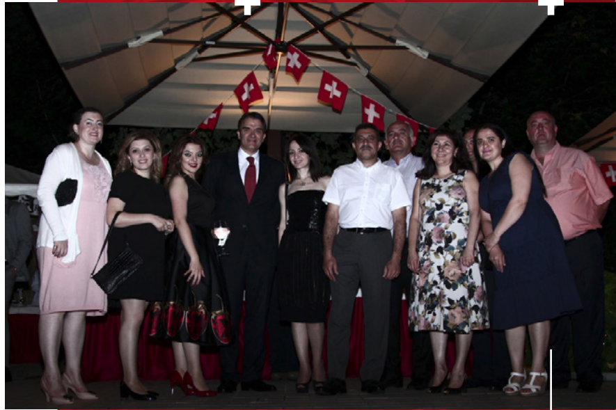
The team of the Embassy at the National Day celebrations

This year, our independence day was celebrated on the very date of the commemoration: 1st August. The weather turned out to be quite Swiss for this occasion – the right environment for enjoying the excellent Raclette brought directly from Switzerland. Despite the peaking summer break, 250 distinguished guests graced this beautiful gathering