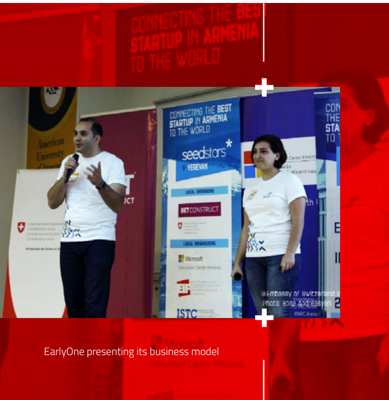
EarlyOne presenting its business model

For the third time in Armenia the Embassy of Switzerland partnered with Geneva-based Seedstars World for the local startup competition. The event was held on June 25, 2016. Seedstars World is an exclusive startup supporting network. The ten best startups from Armenia were invited to pitch in front of an investment panel. This year's winner EarlyOne has devised a queuing system to help its users save precious time instead of wasting it while standing in lines. Good luck to EarlyOne at the global Seedstars Summit in 2017 in Switzerland!