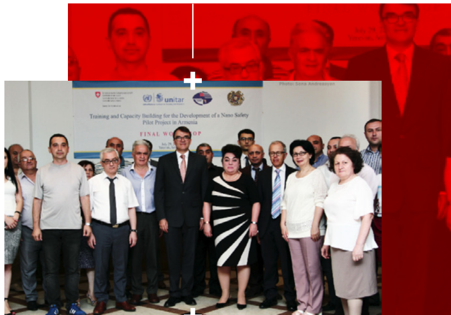
The Ambassador Lukas Gasser with the participants of the workshop

Switzerland concluded a series on workshops on the safety of Nanotechnology in Yerevan on July 29, 2016. This workshop was organized with the special expertise of the United Nations Institute for Training and Research (UNITAR) and brought together leading Armenian specialists in the field of nanotechnology. Ambassador Lukas Gasser and RA Deputy Minister for Nature Protection Simon Papyan opened this productive meeting. By implementing a Nano safety roadmap, Armenia can play a leading role in the region and on the international stage.