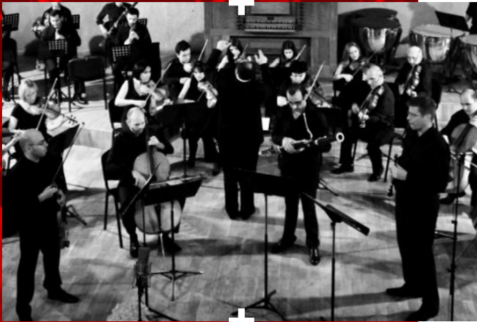
Young Swiss Musicians in Armenia