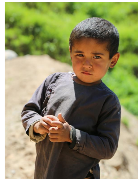
Boy, Bamyan Province, 2017

In 2016, Switzerland started a three-year contribution to the CHF of a total budget of 1 million Swiss francs. Through this support, Switzerland contributes to life-saving assistance to children, women and men, and to the relief of the most urgent and constantly fluctuating humanitarian needs in the country. Moreover, through the CHF Advisory Board and regular consultation with the CHF donor group, Switzerland actively participates in the policy dialogue and advocacy work on relevant humanitarian issues.